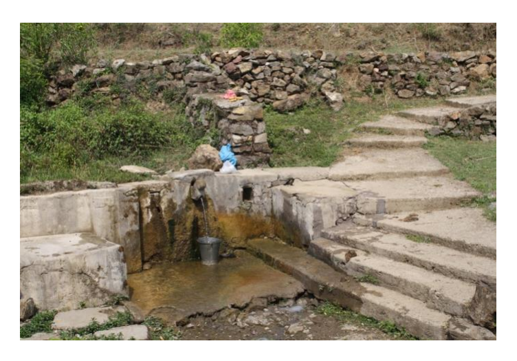
Image 4: One of the natural springs in the Malla Banas Village. A bucket lies under the water stream to collect water for washing clothes. Members of the community were seen at the site bathing and collecting water (Author).

children even go with me when they could walk, carrying small vessels for water," Tanu says. All of the family members go to the spring to collect water together on special occasions, involving everyone in the ritual.