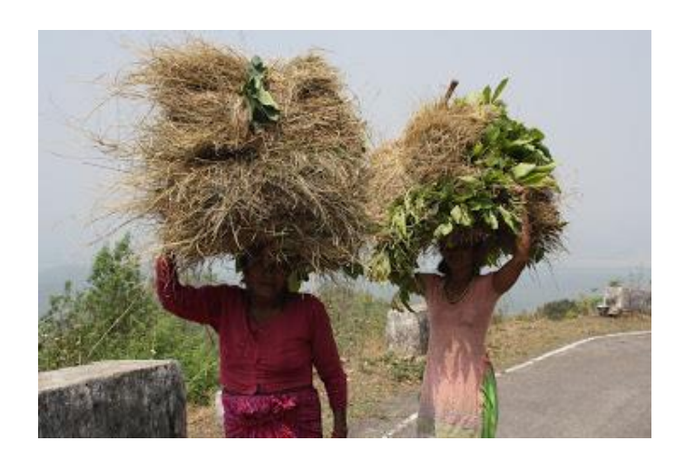
Image 2: Two women carry bundles of fodder on top of their heads on the side of the road in Talla Banas village. They walked several kilometers to collect the materials from the forest for their livestock.

This daily strain, however, seems to have brought the women together in a tightly-knit community. It was common to see several women walking to collect water from the source together, forming a shared space to socialize and perhaps make the task more enjoyable. Tanu says of the spring, "I am happy to go there because it is a routine and a meeting point."