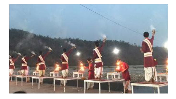
Image 1: The nightly aarti , or prayer ceremony, on the banks of the Ganga at sunset. The ceremonial flames are accompanied by singing and musical instruments.

It was apparent that "River confluences are considered especially sacred" (Mallet, 2017, p. 24), as upon visitation to the Devprayag, people of all ages and socio-economic statuses were observed worshipping the spring in different ways. Some prayed silently, dipped their feet, others splashed water on themselves and drank with their hands, other still submerged their entire bodies into the rushing water while they clung to ropes. "When they had bathed they felt cleansed: not just bodily, but in spirit.' – The Ramayana" (Mallet, 2017, p. 23). As the Ganga is pure and has cleansing properties, bathing in her water is considered to absolve personal sins and cleanse the soul. A priest later came at sunset to perform the nightly aarti , a prayer ceremony involving flames.