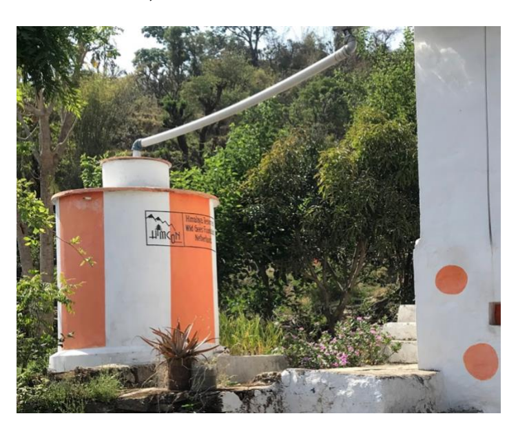
Image 5: A decoratively painted HIMCON water storage tank in a village home. The tank is constructed from low-cost Ferro-cement and can hold up to 5000 litres of water. This tank has a pipe connected to it for harvesting rainwater from the roof (Author).

Many households in the villages of Pauri Garhwal also have rainwater harvesting tanks constructed in their homes, such as the one below.