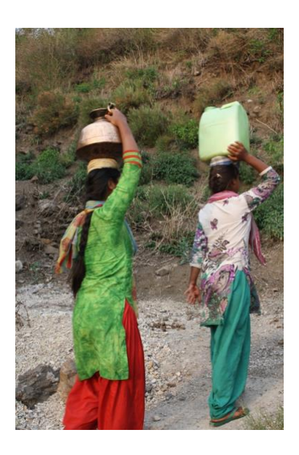
Image 3: Village women return together from the spring, gracefully balancing heavy plastic and copper vessels filled with water on top of their heads.

This daily strain, however, seems to have brought the women together in a tightly-knit community. It was common to see several women walking to collect water from the source together, forming a shared space to socialize and perhaps make the task more enjoyable. Tanu says of the spring, "I am happy to go there because it is a routine and a meeting point."