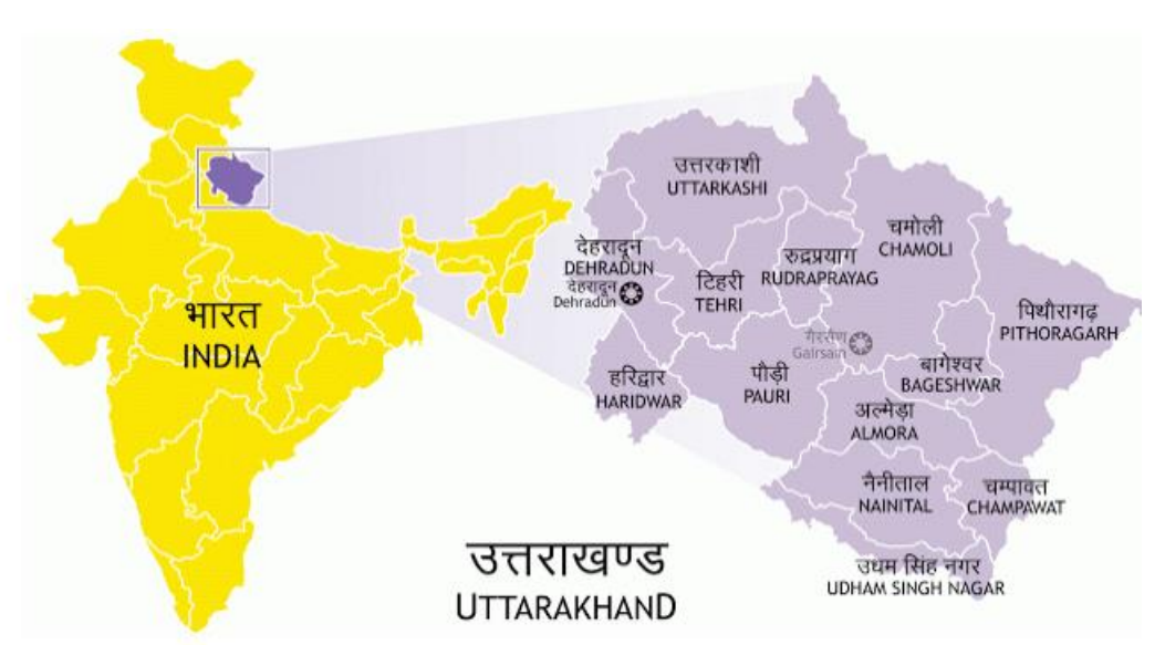
Figure 1: Map demonstrating the location of the Uttarakhand region in Northern India, as well as the location of Pauri Garhwal in the southwest of the region (http://uttaranchal.org/uttarakhand).