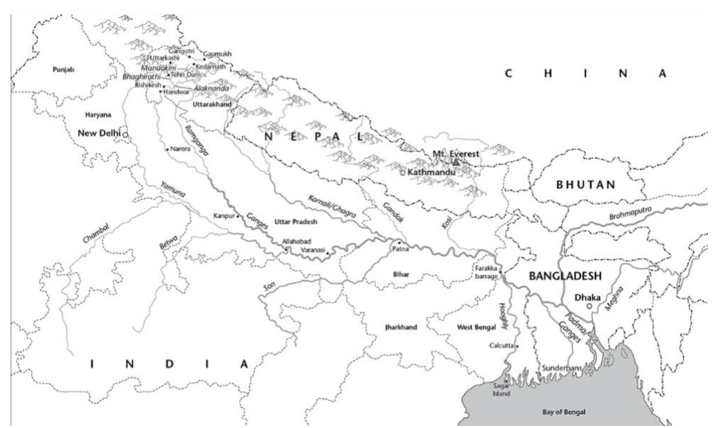
Figure 2: Map showing the route of the Ganges River, from the mouth of the in Gangotri in the top left corner, moving west across the country to open into the Bay of Bengal in the lower right corner (Mallet, River of Life River or Death ).