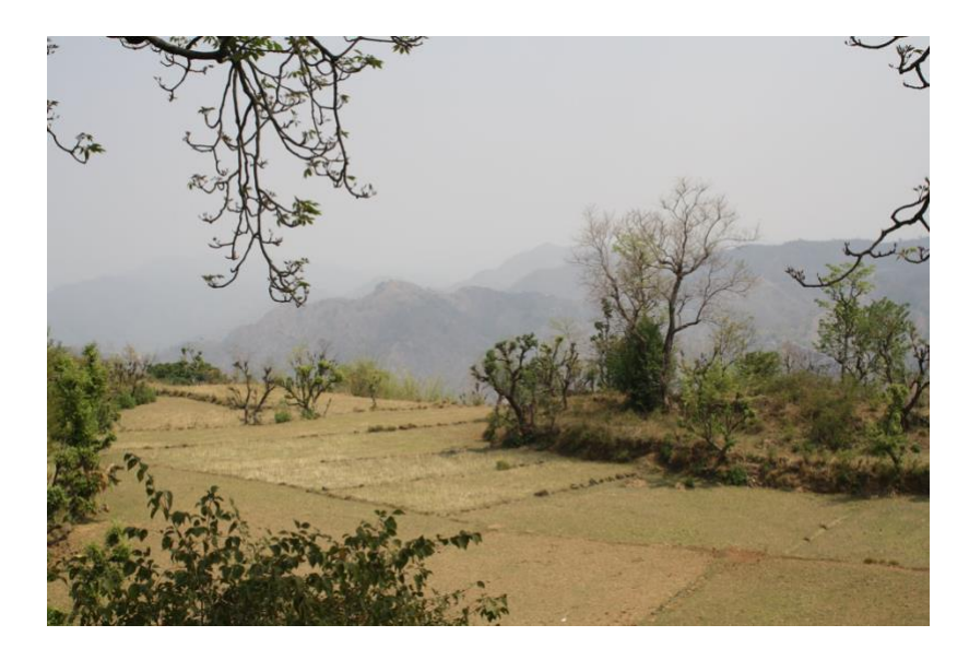
Image 6: Pastures on the hillside with a view of the Himalayas in the background. This is a normal view from the villages in Pauri Garhwal (Author).

When asked whether there has been a change in the community's use of the spring over time, there is a response of agreement from the participants although their reasoning for the shift differ. While some attribute the physical migration of individuals out of the region, others say it is the general change in perspective of the community – to a more individualistic mindset which prioritizes personal profit rather than communal success. Or even a combination of both the physical and mental migration away from a traditional lifestyle. When asked about noticeable changes in the village, Tanu reflects, "There is a change in the attitude and water consumption patterns of the village [...]. Men and women used to be a team and work together as a family. Nobody went hungry, there was a relationship between people." Regardless of the reason, it is becoming apparent that many aspects of the rural life in the villages are becoming less popular for new generations when modernized areas have a sense of instant gratification, as opposed to the physical labor required in livestock and agriculture. The exception, however, is the draw of rituals that bring distant family members home.