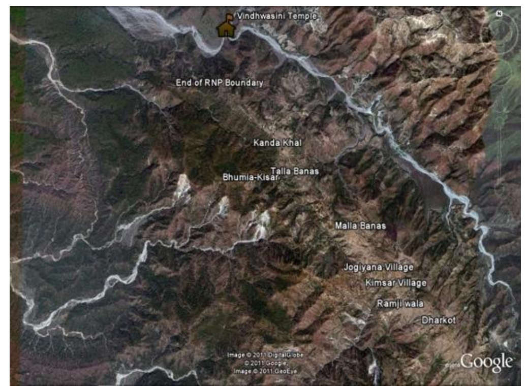
Figure 4: Topographical map demonstrating the locations of villages in Pauri Garhwal. The scope of this paper covers from Talla Banas village to Dharkot (HIMCON).