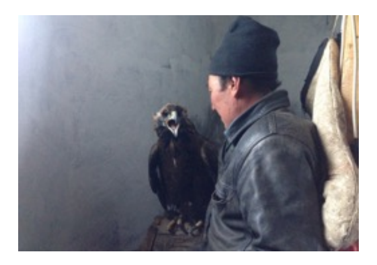
Figure 3. A falconer shows off his eagle. Pictured on the right is the glove that the raptor perches on when the pair is hunting.

Other animals hanging on the hunters' walls as trophies included pheasant, owl (AS-4, A-1), and what looked to be a ferret or weasel (A-4). Two juvenile wolves were observed chained, to be used for eagle hunting when desired (Figure 3).