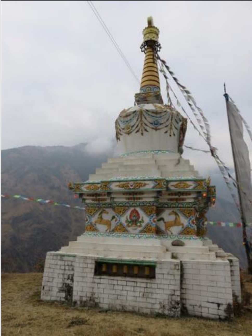
WWF Nepal provided assistance with repairing damage to stupas in Thulo Syafru, as well as aid with rebuilding the single monastery which was destroyed