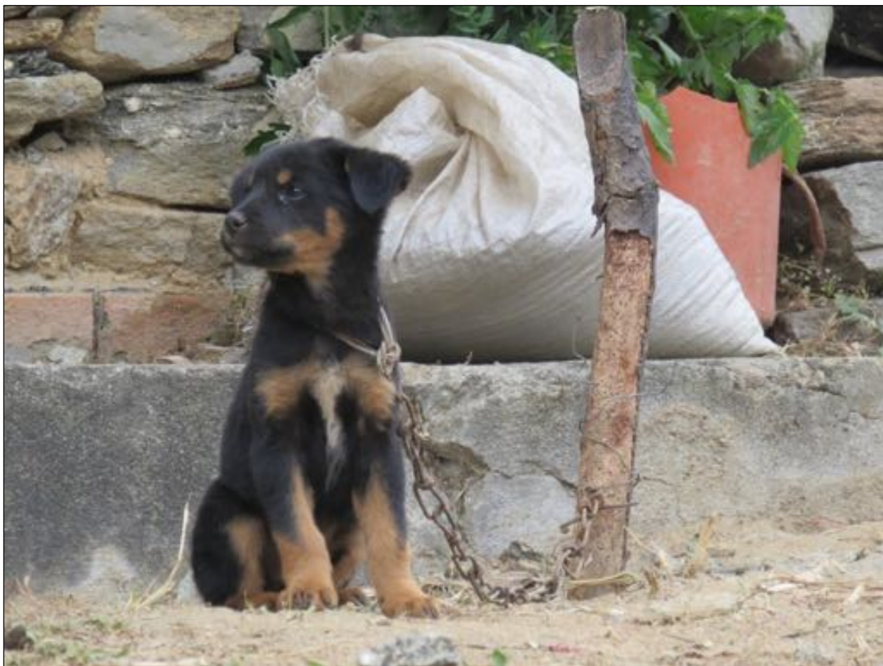
A young dog in Thulo Syafru; canine distemper virus poses a serious risk to red pandas if it is introduced by dogs.

carnivores.” However, this nearly complete reliance on a single bamboo species poses a difficulty, especially when paired with habitat fragmentation; bamboo will remain non-reproductive for many years and then the entire population of an area will flower at once, followed by a total die-off. 4 This necessitates movement by red pandas to find new areas of bamboo in order to survive, but if they are restricted in their movements by habitat fragmentation, their chances of survival are drastically reduced. 4 A further threat is that red pandas are highly susceptible to canine distemper virus, which is lethal to them and there is currently no effective inoculation for red pandas. 4 If canine distemper virus from domestic dogs (either kept or feral) spreads to red panda populations, the results could be catastrophic; and as humans encroach further into the forest bringing dogs with them, the chances of this increase. 4