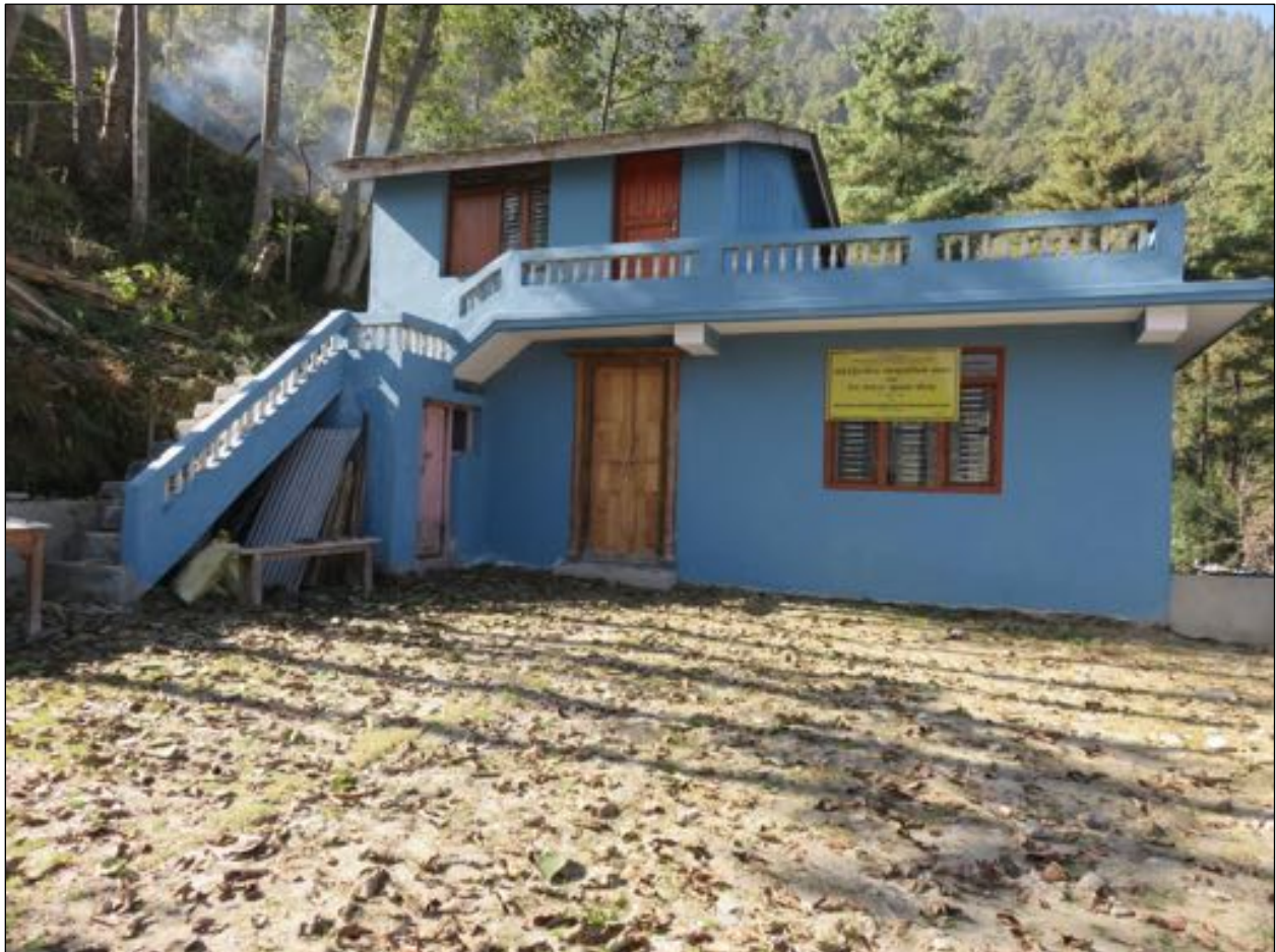
The community building and red panda information center

WWF Nepal provided funding to construct a community building and red panda information center in Thulo Syafru – the building is recently completed but not yet furnished. This represents a remarkable asset for the community and for WWF, as it can provide neutral and functional space for community meetings; trainings and programming by WWF, the national park, or other organizations; and a way to reach, educate, and inform tourists. Per the request of WWF Nepal, several suggestions on how best to utilize the full potential of this building follow.