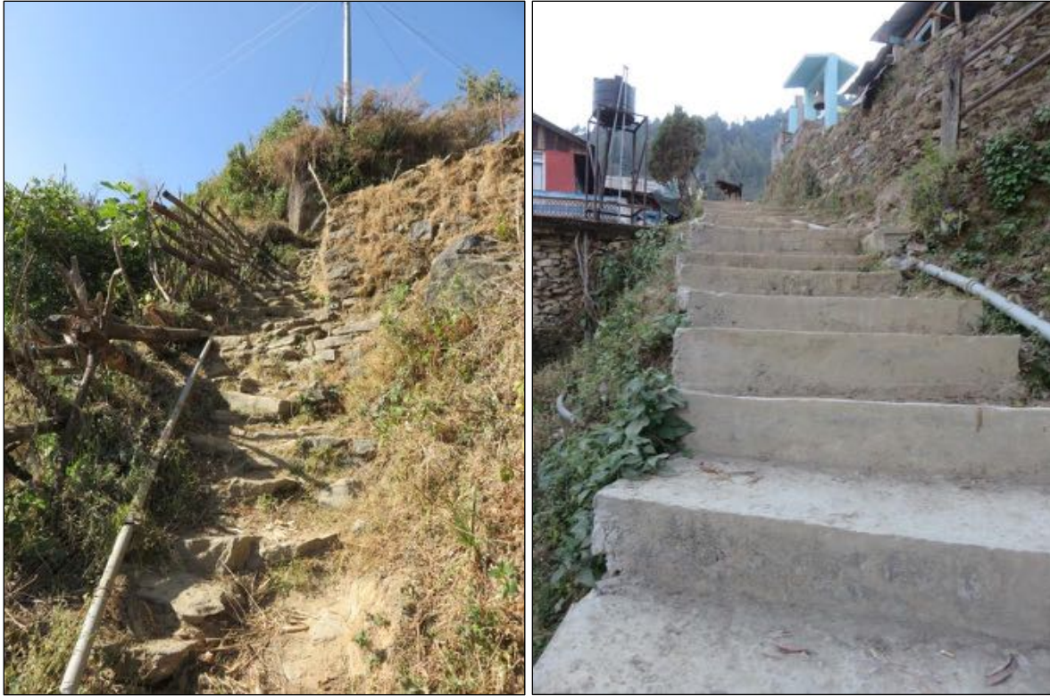
Left: typical stairs found in the village. Right: cement stairs built by WWF. The cement stairs are easier to navigate and are preferred by the villagers.