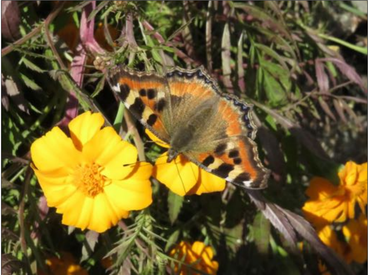
Many people cited appreciation for the natural beauty that has been preserved in Langtang National Park