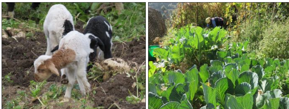
People worry about their livestock being killed by wild predators and about their crops being raided, as these are the primary sources of subsistence and income for many people.

Besides permit fees for harvesting wood, animals raiding crops was the other most discussed grievance. No one reported receiving any compensation but some people said they had heard it supposedly existed. This was clarified by speaking with staff of LNP – compensation is in the works and at the time of writing, was nearing functionality. An endowment, created by funds contributed by LNP, WWF, and other agencies, has been established and the interest from it will be able to fund at least some compensation for damage caused by wildlife. E Many cases have already been filed with the national park and are pending. E This system of compensation will be handled by the BZMC, E and villages are requesting at least 10% of livestock value be compensated. C