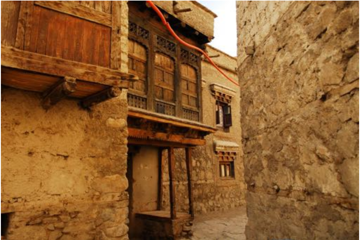
Below: Kashmiri door facades and Ladakhi style windows on the house of Kashmiri trader.