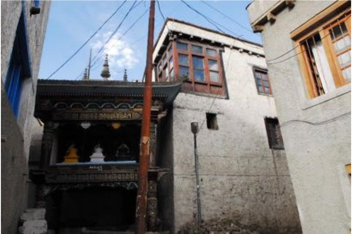
Above: The old residence of a Muslim family hugs a Buddhist stupa.