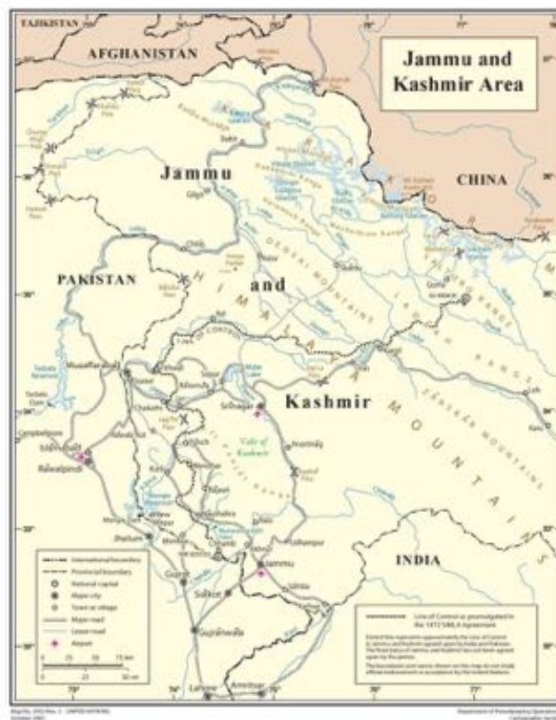
Fig. 2 (Below): Political map of Jammu and Kashmir.