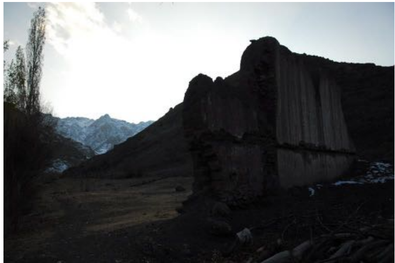
Below: A crumbling chorten next to a sign for Muharram. In the background, the remains of Chiktan fort, built by the same Balti architect as Leh Palace.