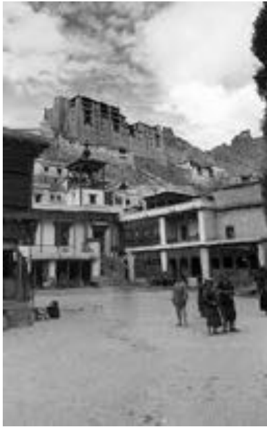
Left: The Leh Bazaar in 1938; the old Jamia Masjid mosque in traditional Ladakhi style.