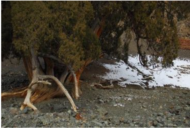
Left: Shukpa Wangchen , the ancient Juniper said to be a powerful lha .