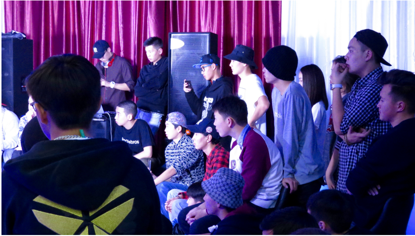
Figure 9. A glimpse of POPPINGxHIP HOP Vol. 1's extremely young audience. (November 15, 2015)