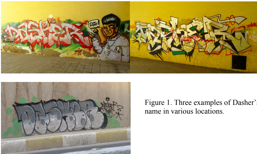
Figure 1. Three examples of Dasher's name in various locations.

When open and aware of their surroundings, pedestrians will find a variety of graffiti while walking down the streets of Ulaanbaatar. Random expletive tags—likely spray-painted hastily by inexperienced teenagers who believe graffiti will make them popular among their classmates (SAS Coze and Dasher, personal communication, November 5, 2015)—splay across formerly untouched wall space. Passersby will also find traditional graffiti, an art form showcasing artists' names depicted in various styles, colors, and locations (Dasher, personal communication, November 5, 2015). As seen in Figure 1, Dasher's name can be found around busy street corners, in alleyways, on courtyard structures. In no two places does his name appear in the same style or colors, as he strives to perfect graffiti techniques and diversify his skills.