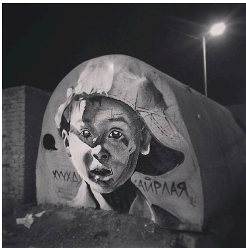
Figure 2. MRCK's portrait of a young boy in Ulaanbaatar's ger khoroolol .

In addition to painting traditional graffiti techniques, MRCK also paints street art with more analytical messages. Through his artwork, MRCK shows Mongolians the problems of society that he perceives. For example, he decided to paint the sad face of a young boy on the side of a wood container in one of Ulaanbaatar's ger khoroolol , as shown in Figure 2. Behind the child and his sideways cap, MRCK painted khuuhd[üig] [kh]airlaya ("love the children"). In this piece, the artist wanted to demonstrate how youth, particularly from ger khoroolol , lack the love, education, and positive influence they need in order to become successful, happy adults. His words prompt adults to think of their behavior toward children and future generations of Mongolians (MRCK, personal communication, November 14, 2015).