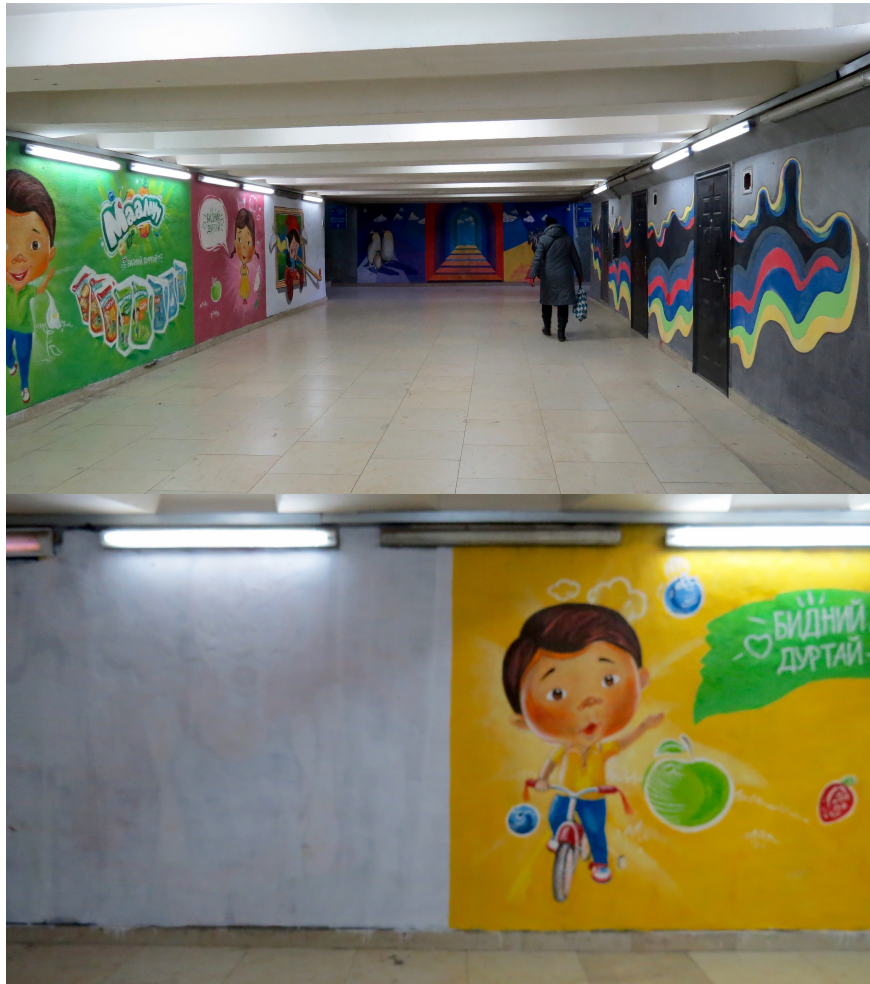
Figure 3. Images of the underground pass formerly featuring a street art commission, now featuring a yogurt advertisement. Some outlines can still be seen of women under the newly white wall.

Erasing art is a common phenomenon in Mongolian street art, as that is a common consequence in arrest for painting graffiti and is an integral part of an artist's rise to prominence. A wall along Narnii Zam ("Sun Highway") is one of the most famous sites for graffiti in Mongolia and is considered the "first official wall" of Mongolian street art. When artists believe they are talented enough to paint in this revered spot, they erase a different artist's older work to paint their own (SAS Coze and Dasher, personal communication, November 5, 2015). This erasure is indicative of the necessity for Mongolian graffiti, and hip-hop, to reflect contemporary images, ideas, and individuals.