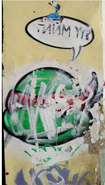
Figure 8. An anonymous piece of graffiti featuring a Teenage Mutant Ninja Turtle character asking “really?” The character refers to a popular American kids’ series that likely only appeared in Mongolia after the Democratic Revolution.

Much like Japanese hip-hop culture, Mongolian “hip-hop is the defining style of [urban youth’s] era” (Condry, 2001, p. 373). Hip-hop expresses the whole truth to young people (Mekh ZakhQ, personal communication, November 7, 2015), who are eager to understand the world and make their own unique way through society. Additionally, today’s young Mongolians are some of the first Mongolians to grow up in a democratic, free society, and they want to explore the cultures and trends to which they have access. Hip-hop is a necessary sub-culture of democratic societies because it proves that citizens are exercising their free rights (Tsetse, personal communication, November 18, 2015). While young Mongolians’ parents and older family members watched the introduction and rise of hip-hop in Mongolia, young people are the first active participants and consumers of Mongolia hip-hop culture. In addition to learning hip-hop’s truth-telling style, Mongolian youth, like the hip-hop battle’s audience members shown in Figure 9, are keen to become part of the larger global trend of hip-hop culture. For some young people, knowledge of Mongolian hip-hop culture is a tool for helping Mongolians make international connections, learn new languages, and open their minds up to the world. Ultimately, Mongolian hip-hop artists represent and relate to young people, whose voices are largely ignored in a country—and world—managed by adults.