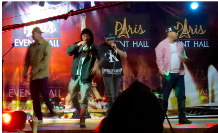
Figure 5. Rappers performing at the NWA Movie Party on November 5, 2015.

The most developed and established form of hip-hop in Mongolia, rap is a highly influential form of music that consists of quickly “talking on beat[s]” (Gennie, personal communication, November 9, 2015) and encourages artists to speak the truth about life, including problems plaguing reality. Rappers speak quickly, confidently, and assertively about anything that they wish, including political and economic problems, women, the self, sex, family, and many other topics; they radiate tough attitudes through dark, baggy clothing and harsh, grainy voices, as seen in Figure 5 (The NWA Movie Party, November 5, 2015).