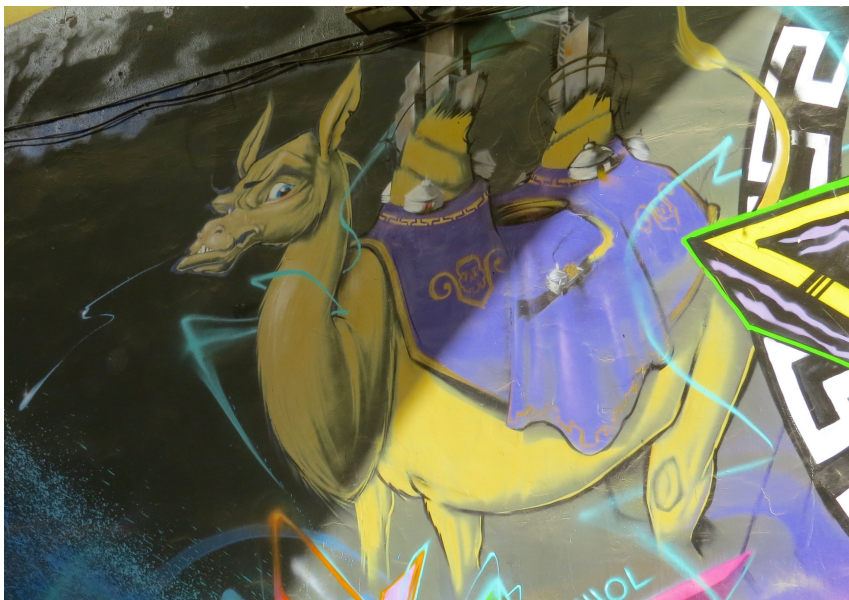
Figure 11. Street art found in a passageway to a courtyard on Peace Avenue, Ulaanbaatar.

Over the last three years, Mongolian graffiti has come to look like its own special hip-hop art form (SAS Coze and Dasher, November 5, 2015), as street artists place special emphasis on drawing and painting works from their own minds. Mongolian street artists still admire other street artists from around the world, but rather than directly copying a foreign artist's work, they instead respect their art and draw inspiration from these artists (MRCK, November 14, 2015). Mongolian street artists' work now confronts more issues and incorporates Mongolian images, designs, and even calligraphy. For example, take note of how one street artist depicts his or her political perspective of modern Mongolia through the use of a native Mongolian animal, a two-humped camel, in Figure 11 below. Skyscrapers sprout out of its humps, while ger rest on the bottom of the humps and surround the cities. A truck full of gold drives out of the camel's center, revealing a rich mine inside of the camel's body. The camel's angry expression, spit, and backward-facing ears indicate defensiveness and agitation to the onlooker.