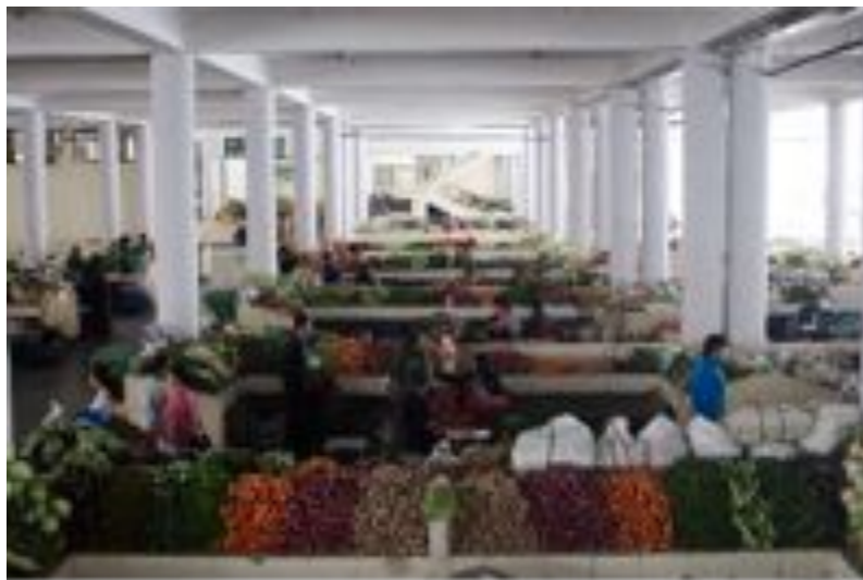
Imports at the Market in Thimphu

don't tell them to try to do that. It is important to be self sufficient and sustainable." 64