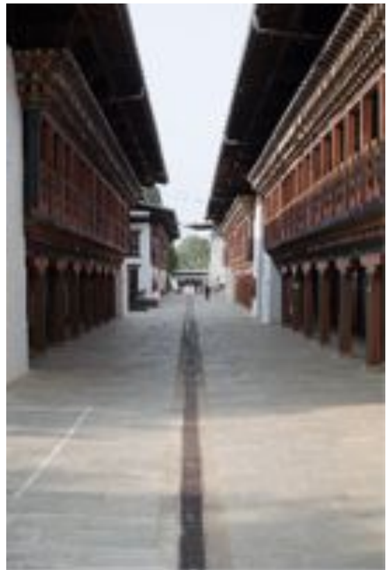
The CNR Campus

The work done in Gasa is in coordination with the research center in Bajothang. Workers at the research center commute from Punakha and pass CNR on their way to work. CNR and the research centers interact frequently. CNR trains the agricultural extension agents that are the connection that farmers have to the government. This is the connection that allows farmers to acquire pesticide and fertilizers and it is how they learn about new techniques. Though the farmers I visited were referred to me by extension agents, each and every farmer regarded the connection with the extension agent the most important source of technical information. For CNR, this means that what is taught there is what will end up in the fields. This responsibility is understood by the lecturers at CNR. “I think that CNR has the keys to an organic future in Bhutan. What is taught here is what will be used by the farmers in the field.” 132 The research center can offer trials and advice to those extension agents. “We run trials to test whether foreign crops can be introduced into this area effectively. We then show farmers our results and compare them to their own methods and let them choose.” 133 Their reach is limited and they rely on extension agents to disseminate information in areas that are not local. There are research centers for each different altitude level, with altitude specific results catered to the farmers.