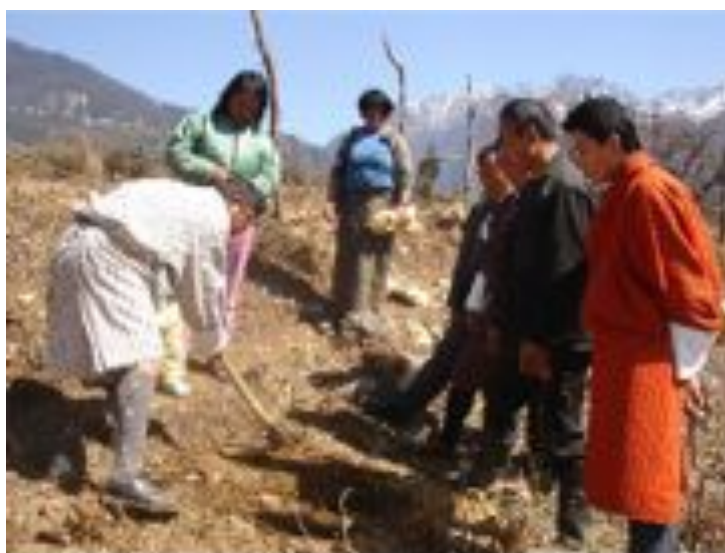
Farmers in Gasa are trained by RC Bajo

Gasa sits an 86 km drive beyond Punakha. It is difficult to get there because taxi drivers do not feel comfortable on the rough roads; They feel their cars will fall apart. I was quoted a price of nearly $100 USD. Gasa is organic by choice and works closely with the Research Center in Bajothang (RC Bajo) to increase yields while remaining organic. The research program was initiated in 2012 and intends to increase vegetable production and marketing. 126 The research center provides training and some additives but hopes that the farmers make their own. “We do provide bio-pesticides, but do not provide bio-fertilizers. We encourage them to make their own.” 127 Before the onset of this program, Gasa was unable to be self sufficient and bought vegetables from the lower regions. 128 With the guidance of RC Bajo, Gasa is becoming increasingly self sufficient. “They still buy rice, but vegetable is self sufficient now and livestock product is enough.” 129 The feasibility in Gasa is aided by its location high in the mountains. “Some places at high altitude have less pest and disease problems. In the south, it is needed, but not