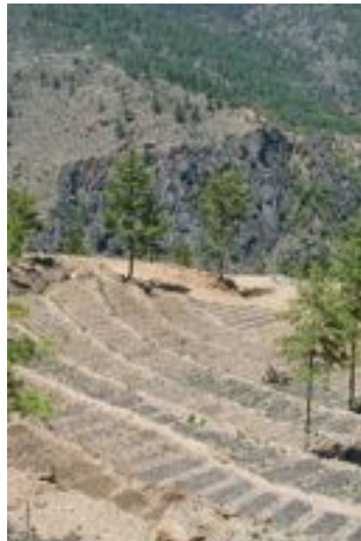
Terraced plots at the farm in Wang Sisina

Wang Sisina is on the road between Thimphu and Paro and is home to a farm that is focused on Integrated Agriculture Technology. “The farm includes three components; integrated, ornamental, and food storage.” 119 The venture began in 2012 as a program to employ the unemployed youth and landless farmers, but in March of 2014, was rebranded. 120 Now, the farm is serviced on weekends by 85 different shareholders from the civil service. 121 The shareholders are expected to come twice a week, Saturday and Sunday, and work the land. This farm is in its infancy and some plots are still under construction. 122 The farm changed purposes under the direction of the Prime Minister in order to offer “recreational exercise” 123 to the civil service agents who spend most of their time on the computer. The Prime Minister himself has a plot. In addition, the farm hopes to be a model for other farmers to go organic. Near the entrance, there is a large plot that is surrounded by a solar powered electric fence and has signs that highlight the technologies being used. Just beyond that, you are greeted by Technology Park. To enter, you pass a fountain that doesn’t yet run, and arrive in a newly planted grass lawn with two rows of crops running down the middle. “We hope that this is a place for people to come and relax, bring their children.” 124 Just beyond the park are several greenhouses that are home to seedlings,