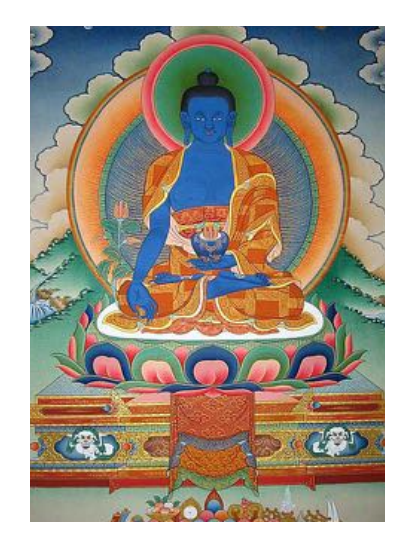
The Tibetan Medicine Buddha

it affects the ways in which we feel both mentally and physically. Within Buddhism and TTM, the mind and body are treated as separate entities that are "inseparable," for they both greatly influence each other in a cause and effect relationship. There is no such illness that is considered to be solely mental or solely physical, for with any illness, there are always mental consequences, as there are physical. So, when treating patients, Tibetan physicians are trained in identifying problems arising within the mind regardless of the type of illness or ailment. In this body-mind link, the mind is said to be both the creator and destroyer of health, the "architect of all our sufferings and happiness." Thus, the mind is directly involved in every aspect of our wellbeing, and much emphasis is in fact placed on mental health in TTM, as it permeates throughout every aspect of its