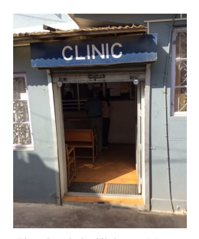
The Gangkyi Clinic at Men-Tsee-Khang in Dharamsala

medicinal herbs and external therapies that are very beneficial for helping maintain the health of the body and mind together. Natural herbs used in medicine that are known for treating wind problems related to mental issues consist of: nutmeg, long pepper, black pepper, clove, saffron, and cardamom<sup>33</sup>. The external therapy of hor-me , for instance, is also very helpful in alleviating wind disorders, promoting mental wellbeing, and increasing circulation throughout the body. Hor-me is a moxibustion technique, the application of heat through pouches filled with herbs onto palms of the hands, soles of the feet, and the three vertebrae points that correspond to the locations of wind.<sup>34</sup>