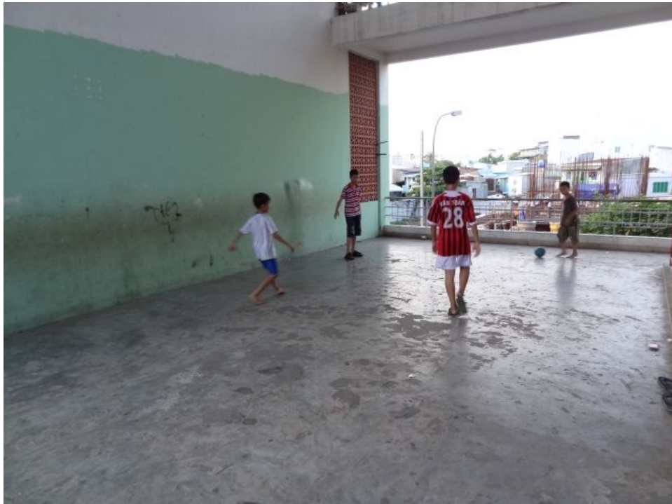
Children appropriating second floor stairwell place for a game of football