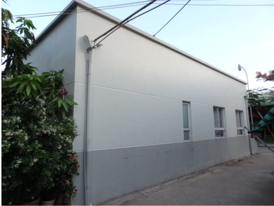
The model apartment home built in front of Family 1's shop house; it blocked the visibility of their store from the resettlement apartment market significantly