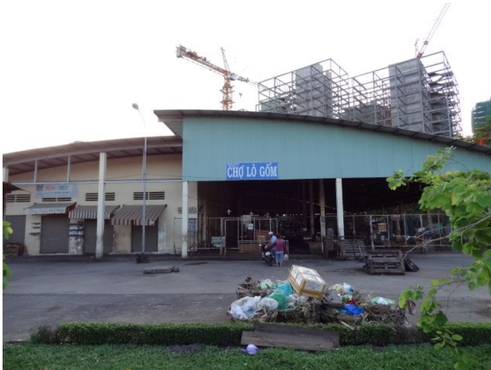
Chợ Lò Gõ, the resettlement housing market next to the apartment complex