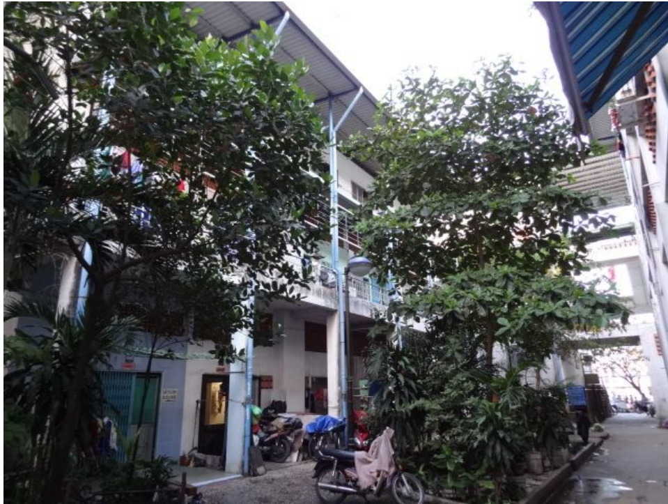
Courtyard in the center of the complex

Front view of the Tân Hòa – Lò Gốm Resettlement Complex with high-rise resettlement apartments under construction behind