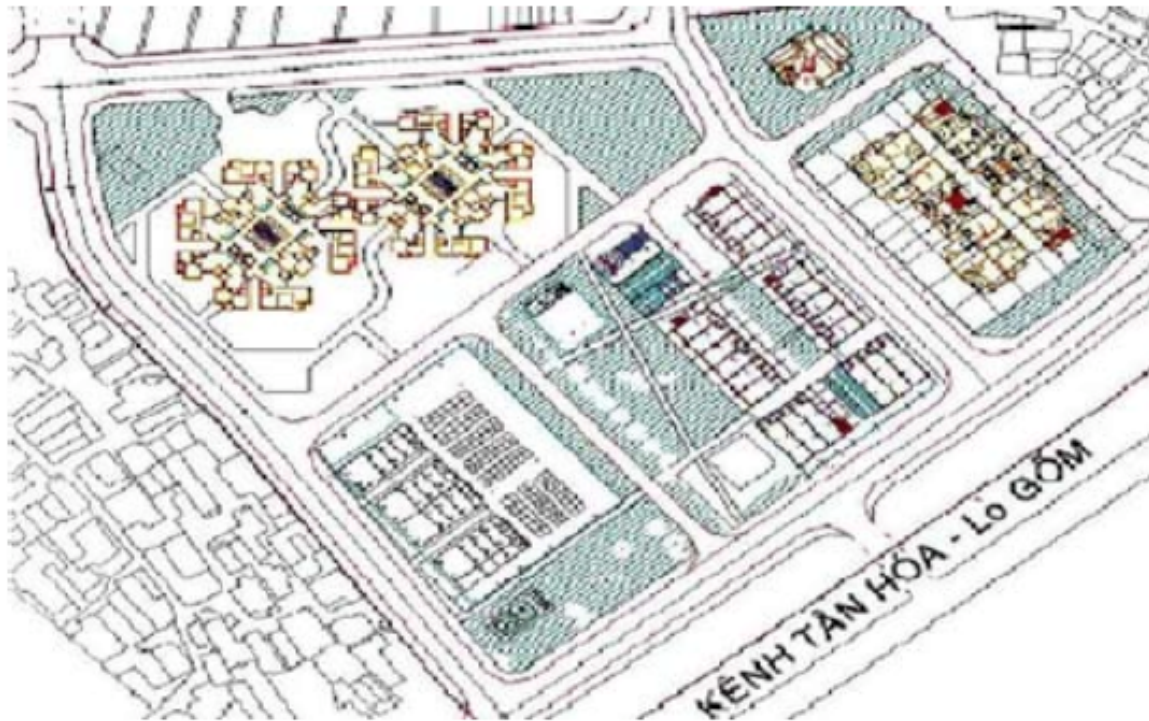
Figure 2: Map of the Tân Hóa – Lò Gốm Resettlement Complex, Phường 11, Quận 6 12