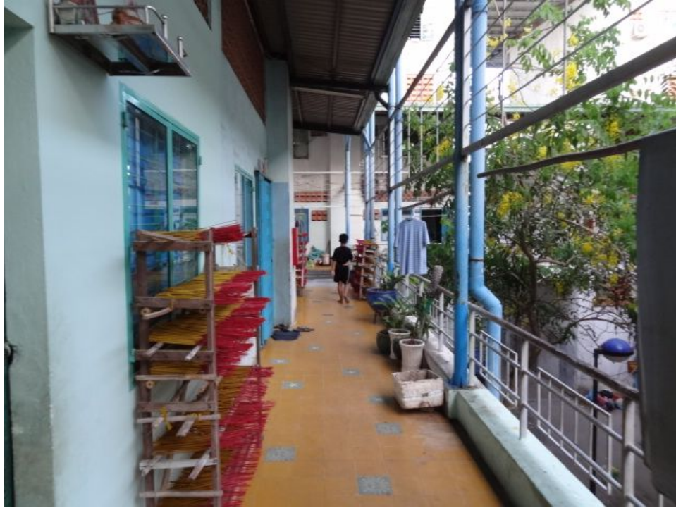
Family 2's hallway with incense production in front of apartment