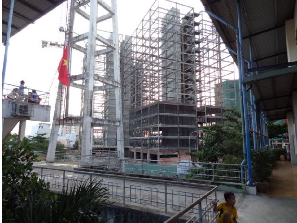
View of high-rise construction outside of Family 2's second floor apartment