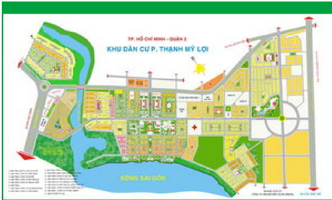
Figure 3: Map of Thanh Mỹ Lợi Resettlement Area, Quận 2 17