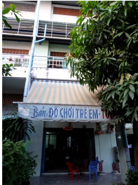
Example of first-floor apartment size, which allows for ground level customer access to Family 1's shop house