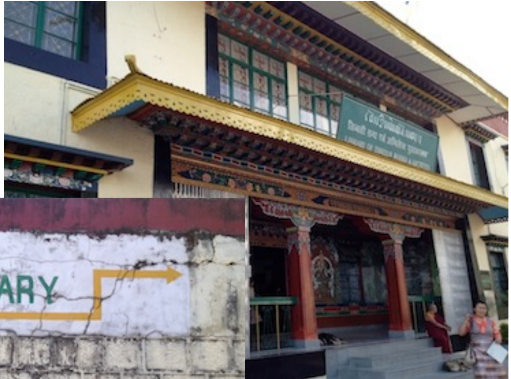
Library of Tibetan Works and Archives | Dharamsala