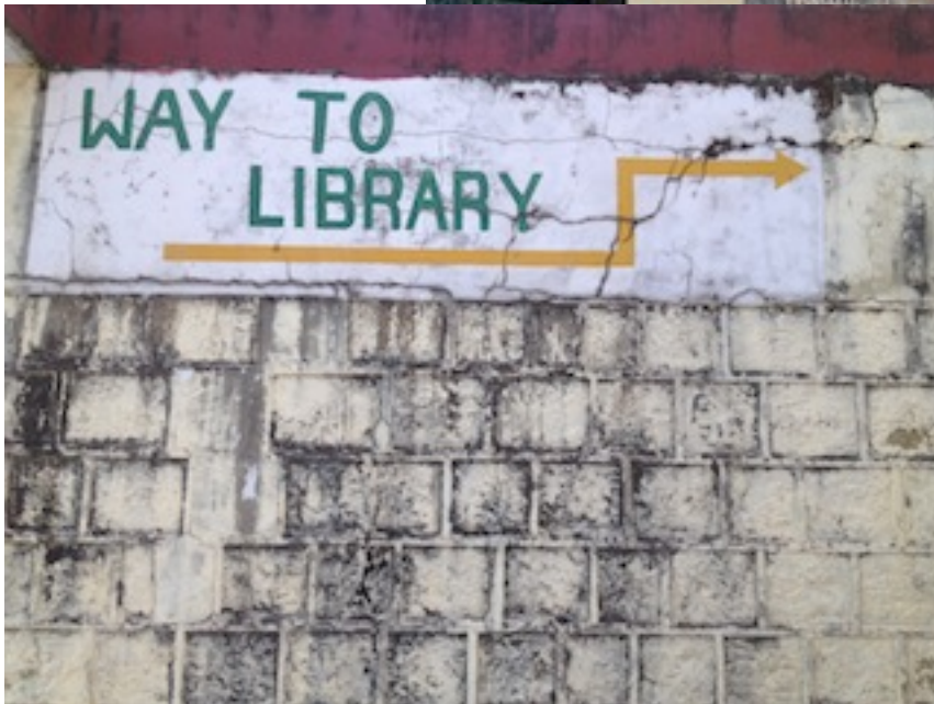
Central Tibetan Administration Department of Information and International Resources, Department of Education and Centre for Human Rights and Democracy | Dharamsala