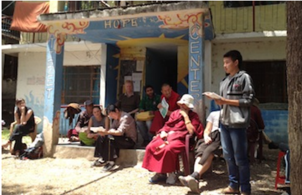
Discussion Class at the Tibet Hope Center | Dharamsala