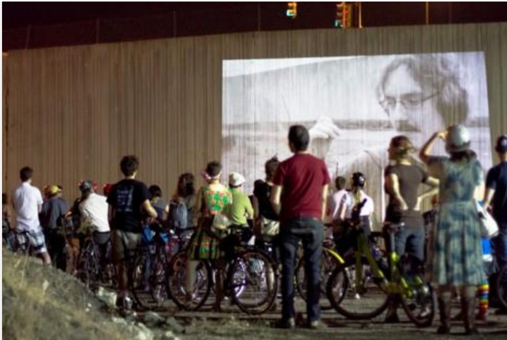
Mobile Experiential Cinema at Northern Spark '11