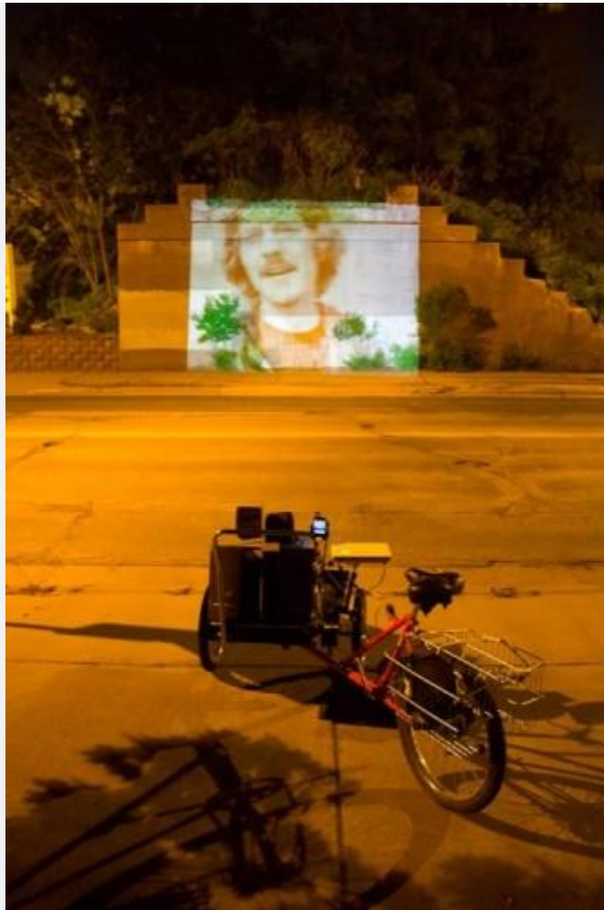
Mobile bike projector

projection and the conflation of the real and imagined in actual space. Essentially, the audience gets to be in a real place that supports the story instead of simply seeing the filmed set of a film.