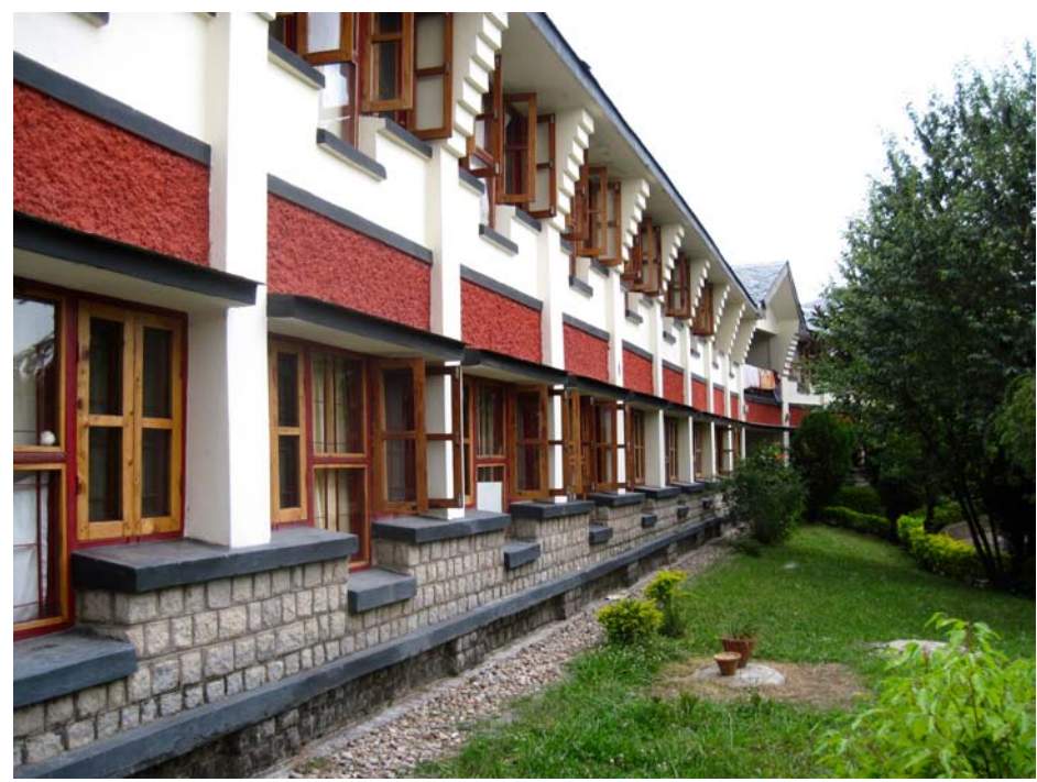
(Nuns' housing at Dolma Ling)