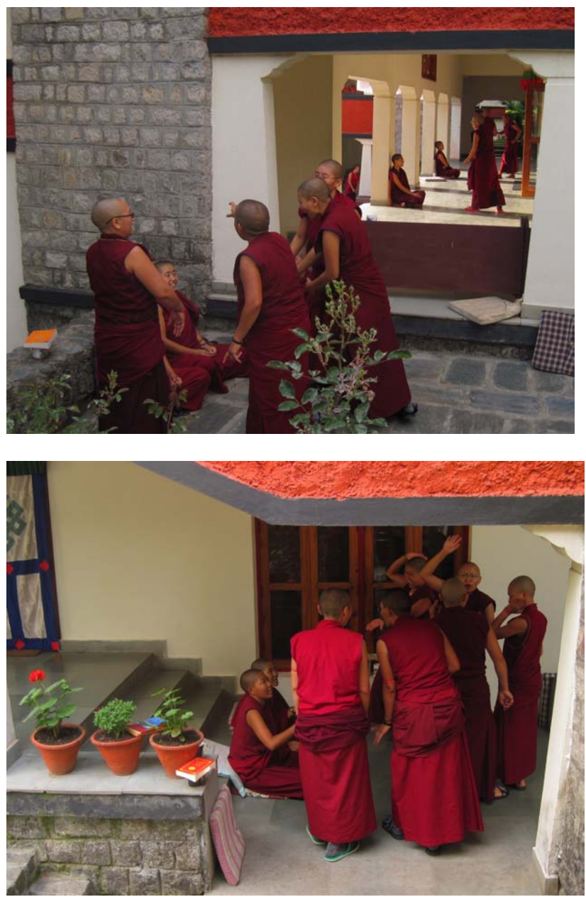
(Nuns getting enthusiastic while practicing debate)

The environment of the practice sessions can be playful, with everyone goodheartedly yelling over one another with smiles on their faces, or even pushing each other aside in some cases so as to make their own point heard more clearly. Under the watchful eye of a monk teacher, however, the tone is much quieter and more serious. The younger nuns are separated into different wings of the courtyard, debating different texts than their elder counterparts.