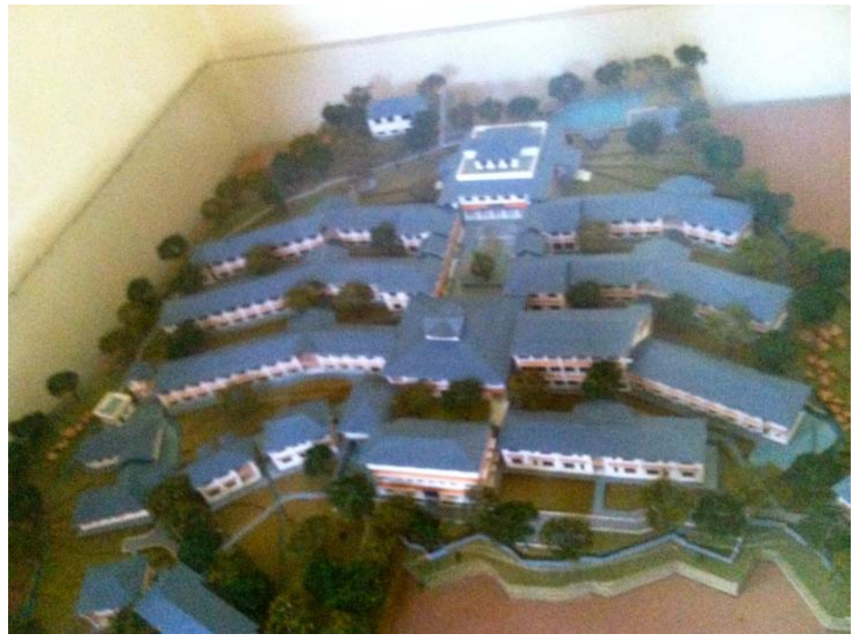
(Small-scale model of Dolma Ling Nunnery grounds)