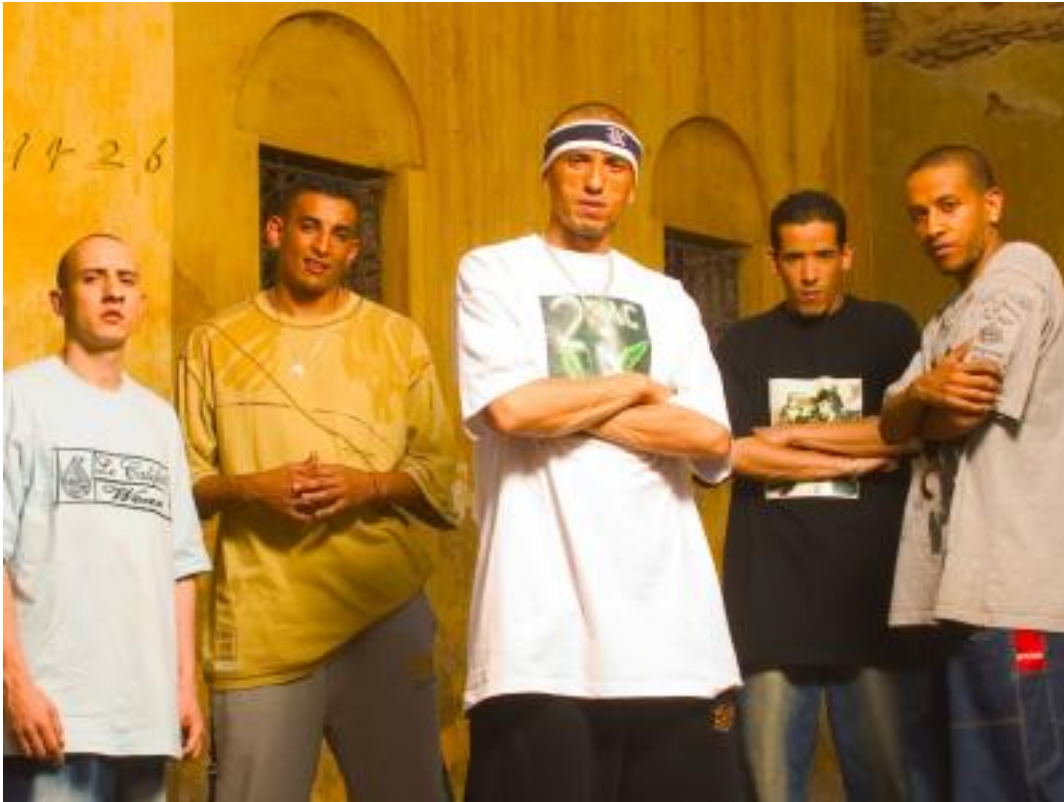
Figure 1: Popular Moroccan Rap Group H-Kayne