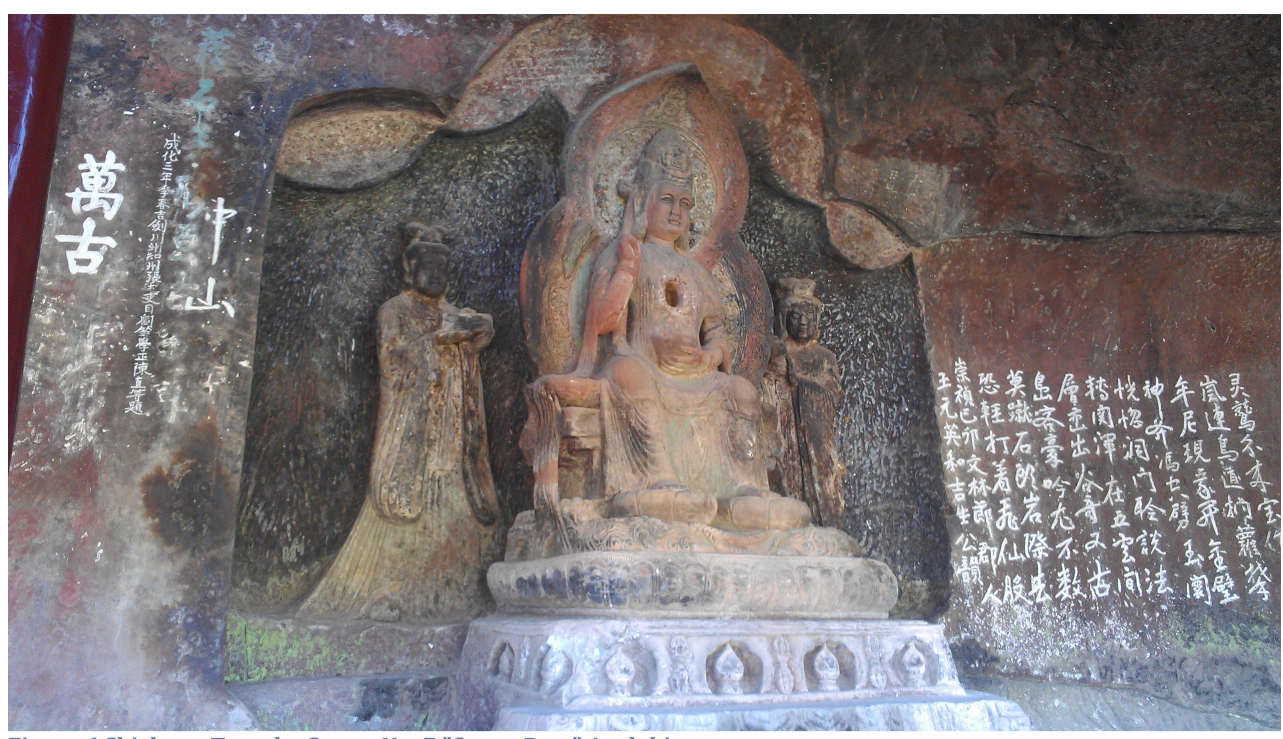
Figure 6 Shizhong Temple, Grotto No. 7 "Sweet Dew" Avalokitesvara