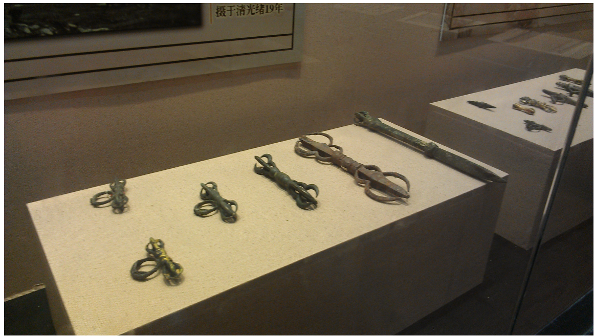
Figure 4 Tibetan-style vajras (Three Pagodas Cultural Park Exhibition Hall)