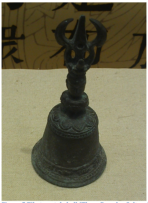
Figure 5 Tibetan-style bell (Three Pagodas Cultural Park Exhibition Hall)