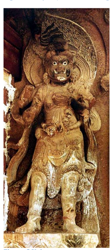
Figure 8 Vaisravana, protector god (Shizhong Temple, Grotto No.6 The Hall of the Heavenly Kings)