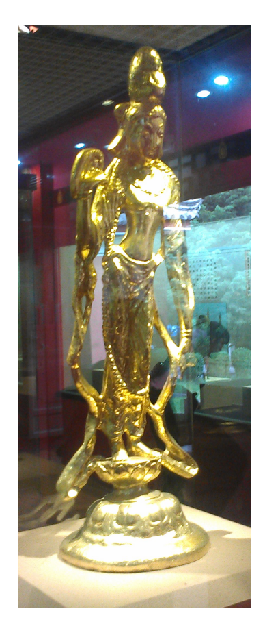
Figure 3 Indian-style Male Avalokitesvara figure (Three Pagodas Cultural Park Exhibition Hall)