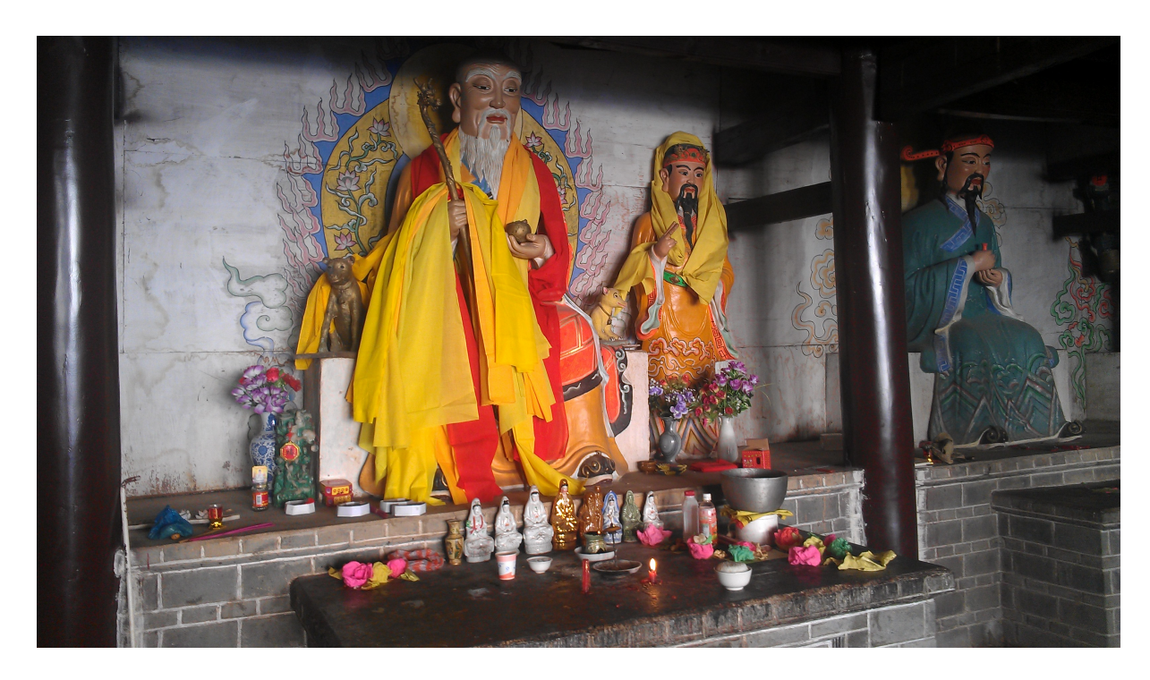
Figure 9 Hufa with ceramic Avalokitesvara figurines (Lamp Village)