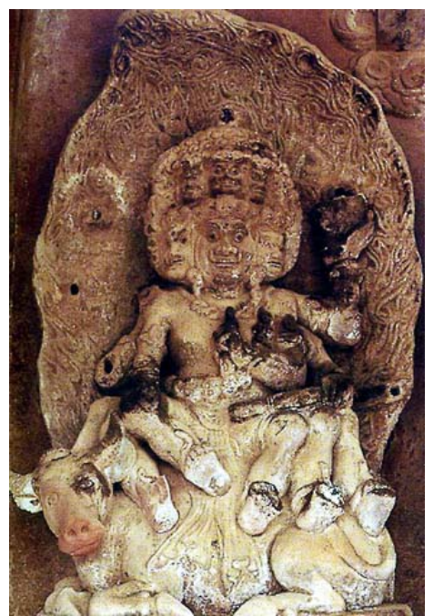
Figure 7 Vidyaraja, one of the Eight Heavenly Kings<sup>42</sup>