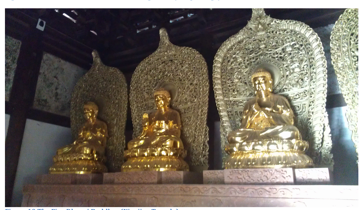
Figure 10 The Five Dhyani Buddhas (Xingjiao Temple)