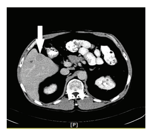
FIGURE 2: Hepatic lesion showing early wash out in venous phase.

AZA use is associated with increased risk of many malignancies including squamous cell skin cancer in patients with rheumatological diseases and lymphoma among IBD patients [17, 18]. However, there are no retrospective studies in medical literature reporting any correlation between the use of AZA and occurrence of HCC in patients with CD.