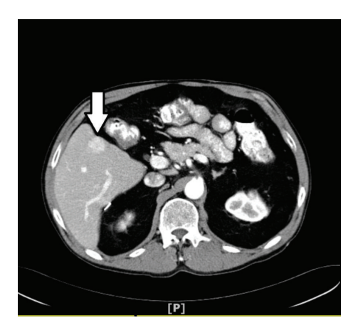
Figure 1: Arterial phase showing 2.2 \times 1.6 \times 2.1 lesion in segment V.

or stigmata of chronic liver disease. Preoperative blood work including liver profile and viral hepatitis markers was entirely normal: AST 18 U/L (<37 U/L), ALT 16 (<60 U/L), albumin 3.5 g/dL (3.5–5 g/dL), bilirubin 0.8 mg/dL (0.3–1.2 mg/dL), and INR 1.0, alpha-fetoprotein 10.3 ng/mL (<6.1 ng/mL), prothrombin time 13.3 seconds, and platelet count 210/\mu L.