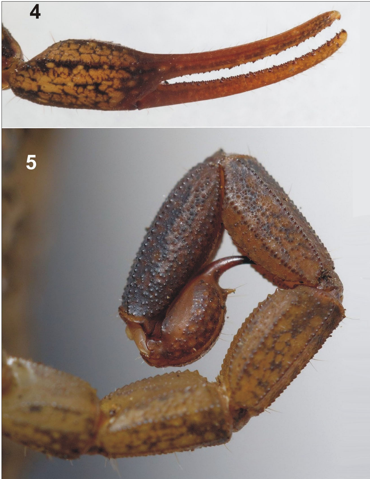
Figures 4–5: Centruroides thorellii . The same female as in Fig. 2: 4, pedipalp chela, dorsolateral aspect; 5, metasoma, lateral aspect.