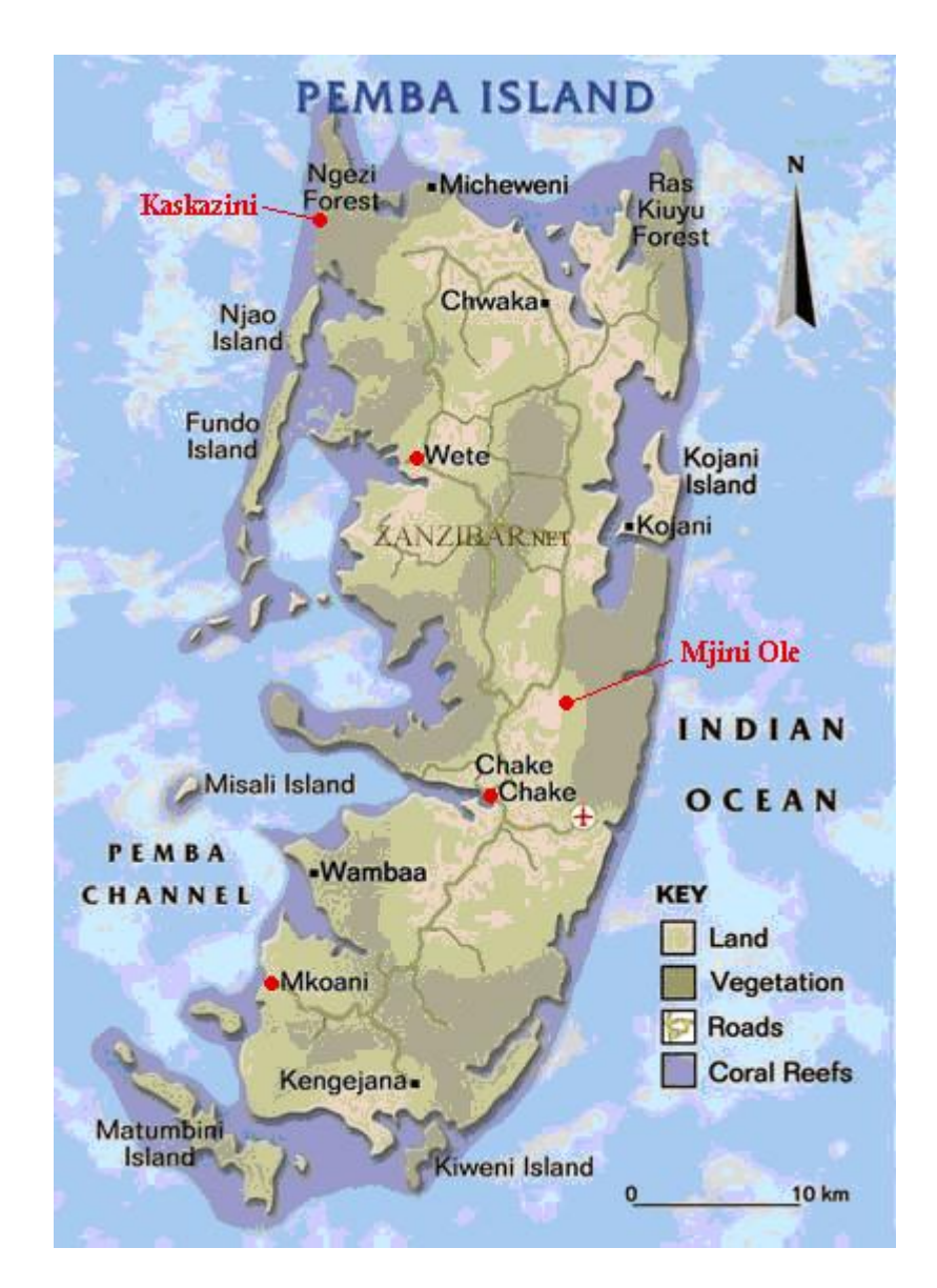
Figure 1. Map of Pemba, showing study sites Mjini Ole, Chake Chake, Kaskazini, Wete, and Mkoani.