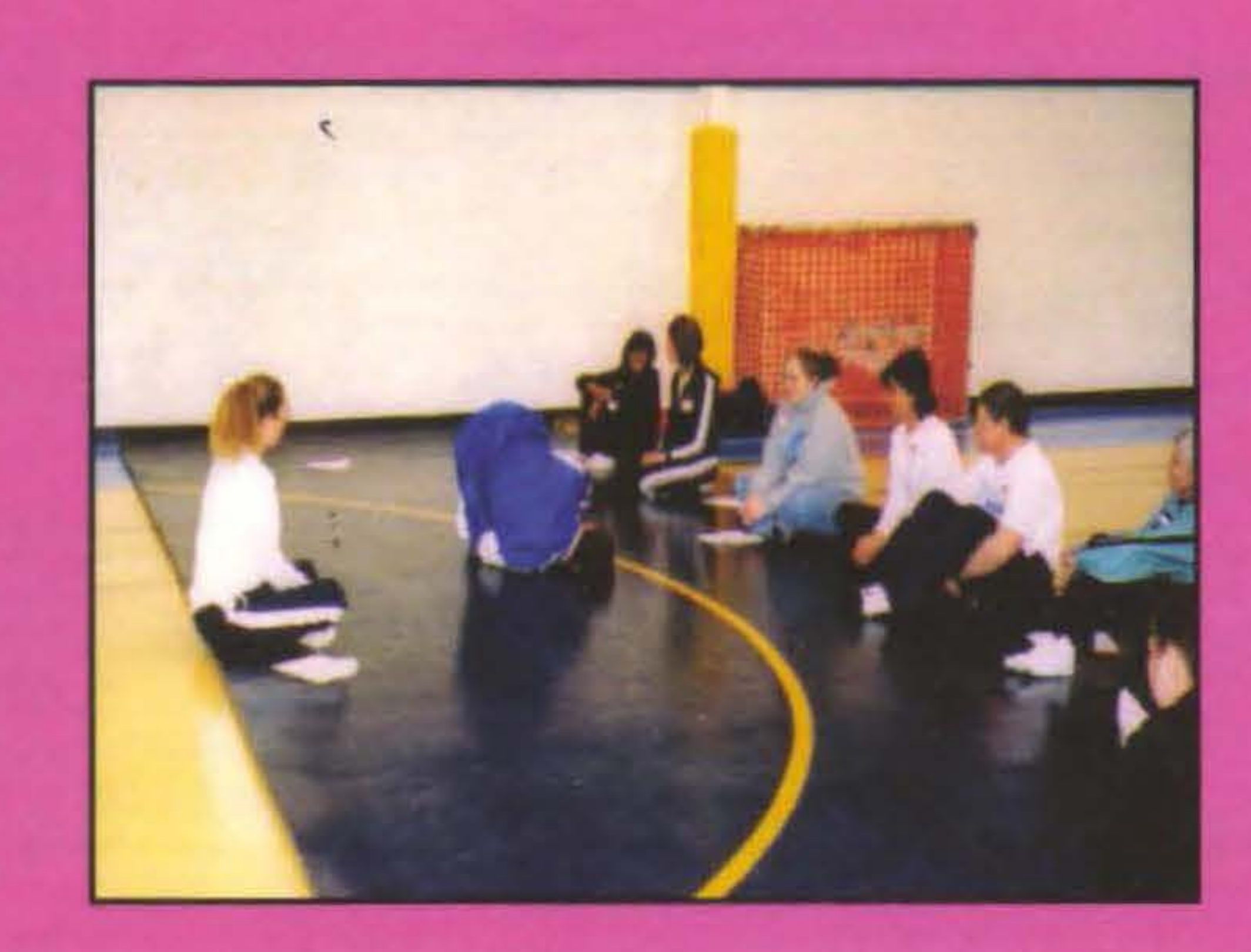
Southeast Michigan MAHPERD/WSU Workshop