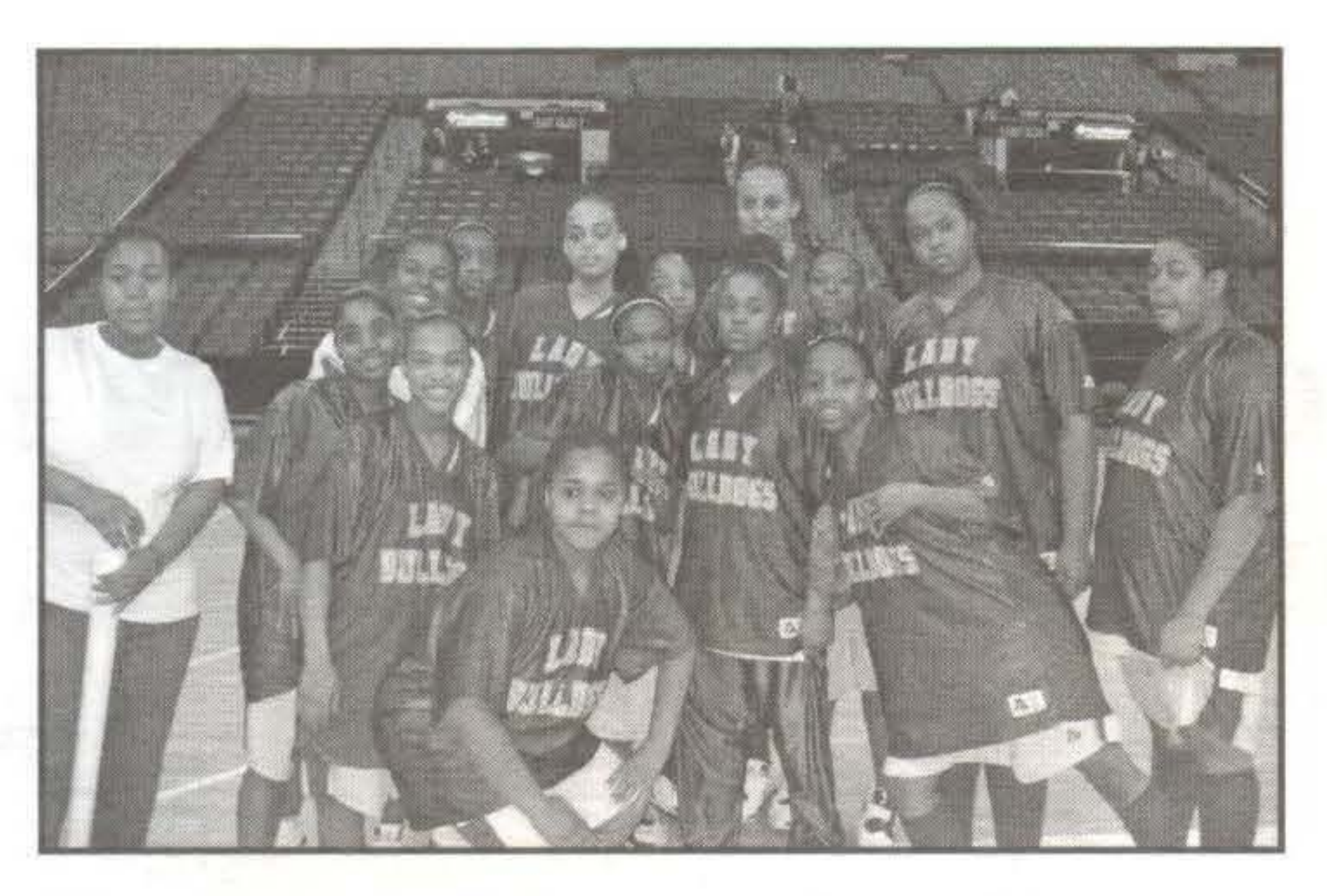
The Lady Bulldogs are from New York City.