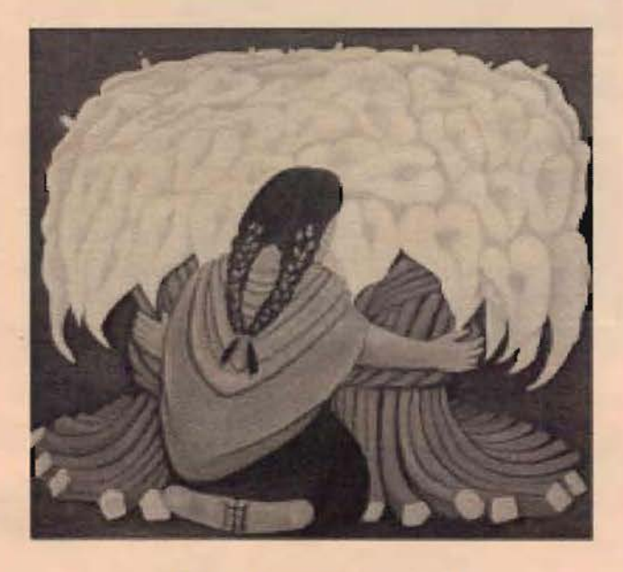
Folk art displayed at the 2002 Appalachian Studies Association Conference