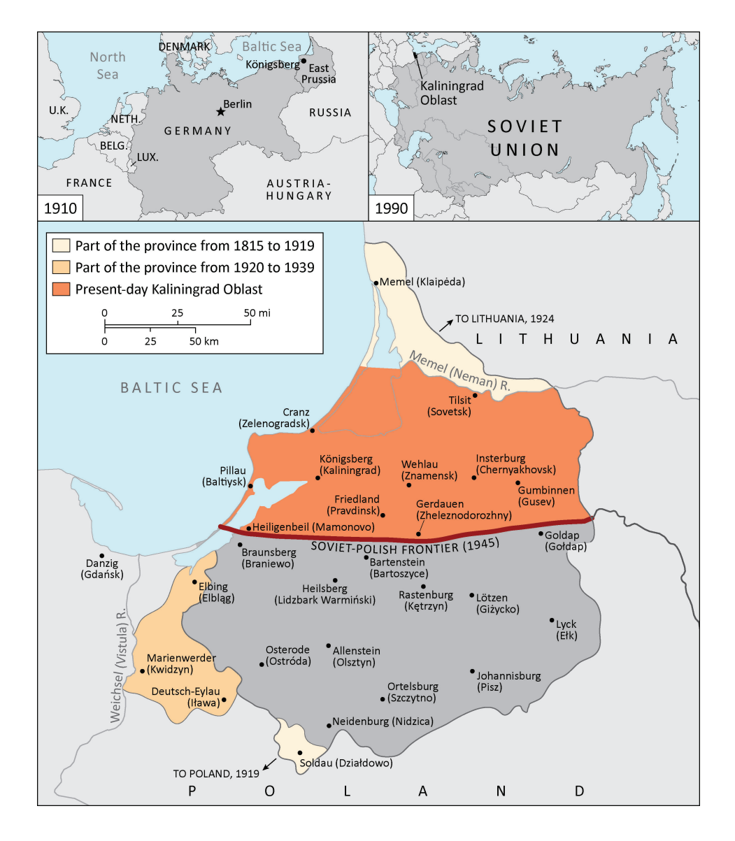
Fig. 1. German province of East Prussia, showing the Soviet-Polish frontier of 1945, pre–World War I Europe (1910, upper left inset) and location of Kaliningrad Oblast on the western margin of the USSR (1990, upper right inset).

and created the Duchy of Prussia as a fief of the Kingdom of Poland. Centered on the city of Königsberg, this duchy was also a cultural exclave because it was separated from other German-speaking lands by Polish-speaking territories. By the late 18th century, the Polish Kingdom had become very weak, while Germany's ambitious Hohenzollern dynasty had inherited the duchy. To consolidate the duchy with their other territories scattered across northern Germany, the Hohenzollerns helped orchestrate the partition of Poland. This transformed the duchy into the province of East Prussia (Fig. 1) in the new Kingdom of Prussia.