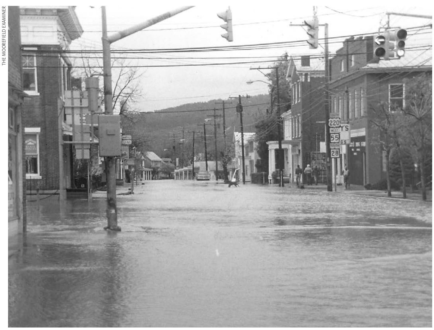
In 1985 the remnants of Hurricane Juan produced flash floods across the state. Here, Main Street in Moorefield, West Virginia, stands under several feet of