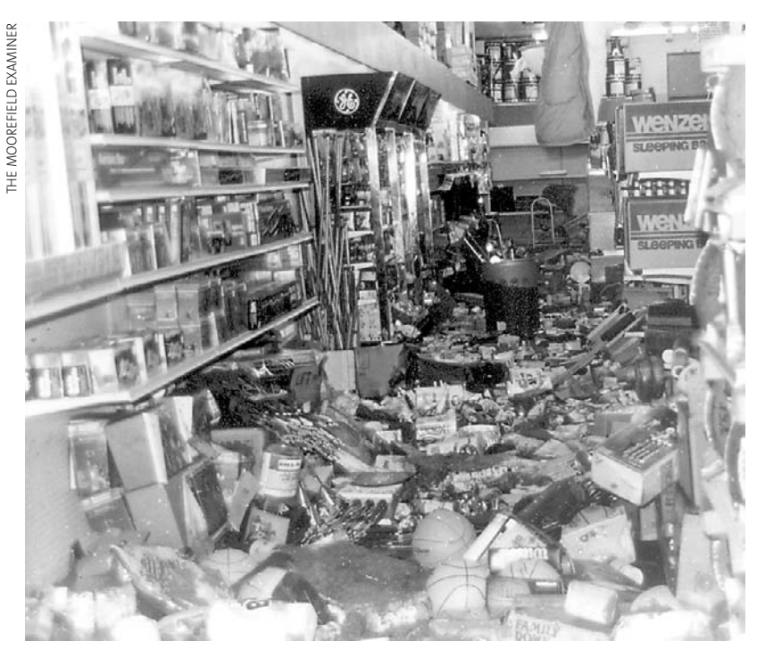
The 1985 flooding wreaked havoc across Moorefield, West Virginia, including the Heck's General Store.

created by the state's unique topography. The few that do occur are usually minor in intensity. However, during the famous April 3-4, 1974, nationwide tornado outbreak there were at least six tornadoes reported in the state. On April 9, 1991, a derecho event developed from a bow echo that raced across the state. Winds exceeded 80 mph in many parts of the state, with more than 200,000 residents losing electricity. Two deaths and 86 injuries were also attributed to these high winds. Not since the 1974 tornado super-outbreak had there been so much damage.