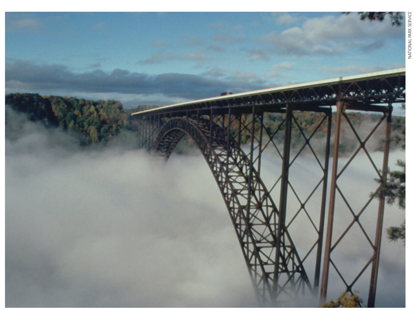
West Virginia is one of the foggiest locations in the country. Here, fog swirls around the base of the New River Gorge Bridge.

West Virginia has a wide array of severe weather including thunderstorms and snowstorms. Tornadoes are rare (only an average of two per year), primarily because of the climate