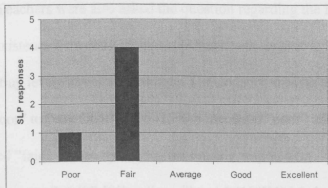
Figure 1: Existing levels of collaboration on literacy instruction (according to SLPs)

In the second section of the survey, SLPs were asked the question: “Do you meet with school teachers and specialists to plan intervention for students on your caseload?” To this question, 4/5 (80%) responded “yes” and 1/5 (20%) responded with “no”. SLPs were also asked, “What level of collaboration (between teachers and SLPs with regards to literacy) do you feel exists presently at your school?” Given the options of “poor”, “fair”, “average”, “good” or “excellent”, 4/5 (80%) responded with “fair” and 1/5 (20%) responded as “poor”. No SLPs responded that collaboration was either “average”, “good” or “excellent”. Figure 1 indicates: