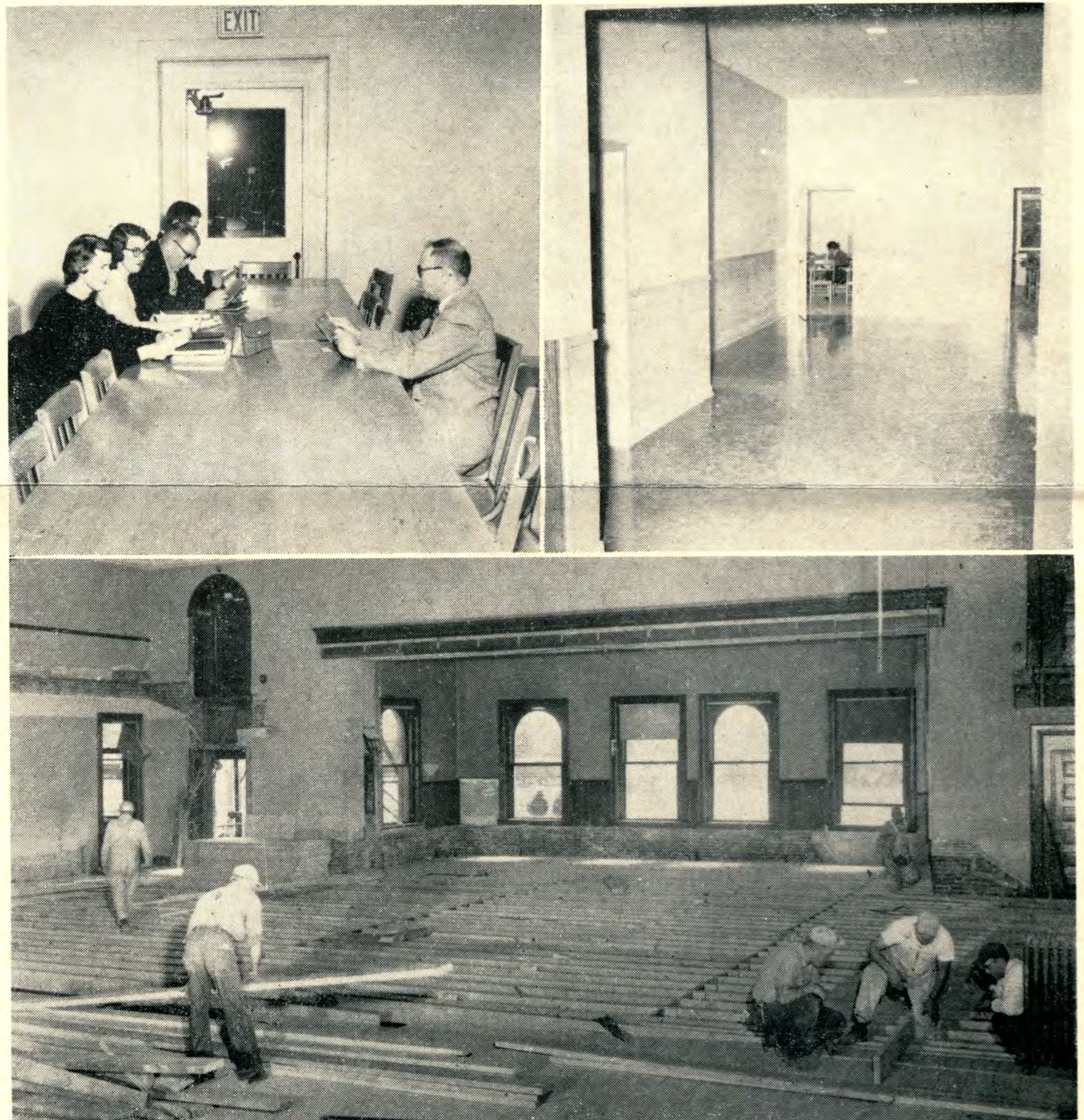
Lower: looking toward the stage . . . the auditorium sheds its old look. Upper right: entrance and hallway leading to new classrooms and offices. Upper left: Dr. Van Aver and class discuss oriental literature in new seminar room.

The addition of this new dormitory will mean that 172 men students will have dormitory housing on the campus.