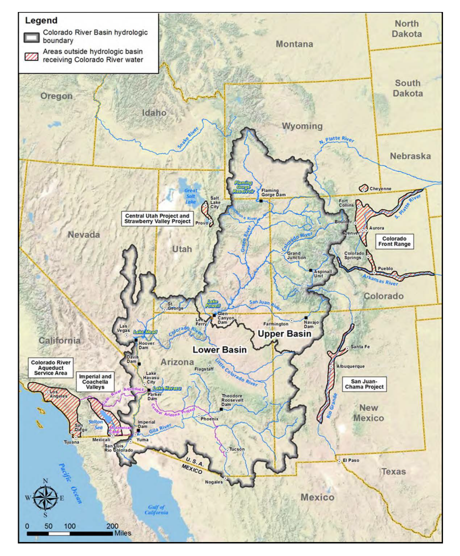
FIGURE 1. COLORADO RIVER BASIN AND EXPORT AREAS<sup>33</sup>

Water institutions in the Colorado River Basin mirror the transboundary relations just discussed in scope and complexity. These institutions generally fall into intertwined categories of legal and policy infrastructure and physical infrastructure.