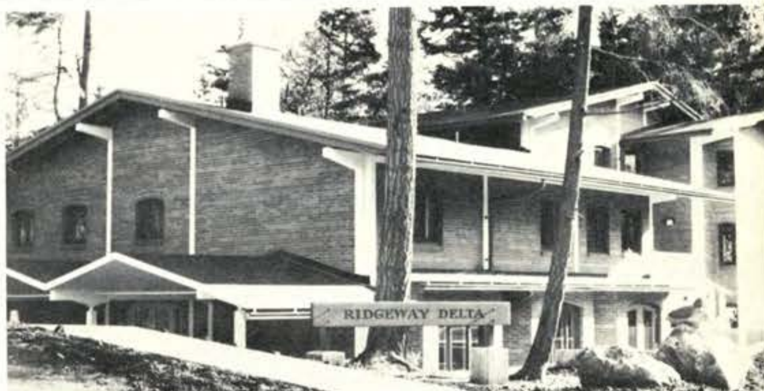
Ridgeway Delta is one of four structures which makes up the 400-bed dormitory complex overlooking the athletic field. The $1,800,000 complex opened at capacity this fall.

Five-story wings east and west of the main Library went into general use this fall. The $950,000 addition houses stack rooms, classrooms, offices, periodical and reading rooms.