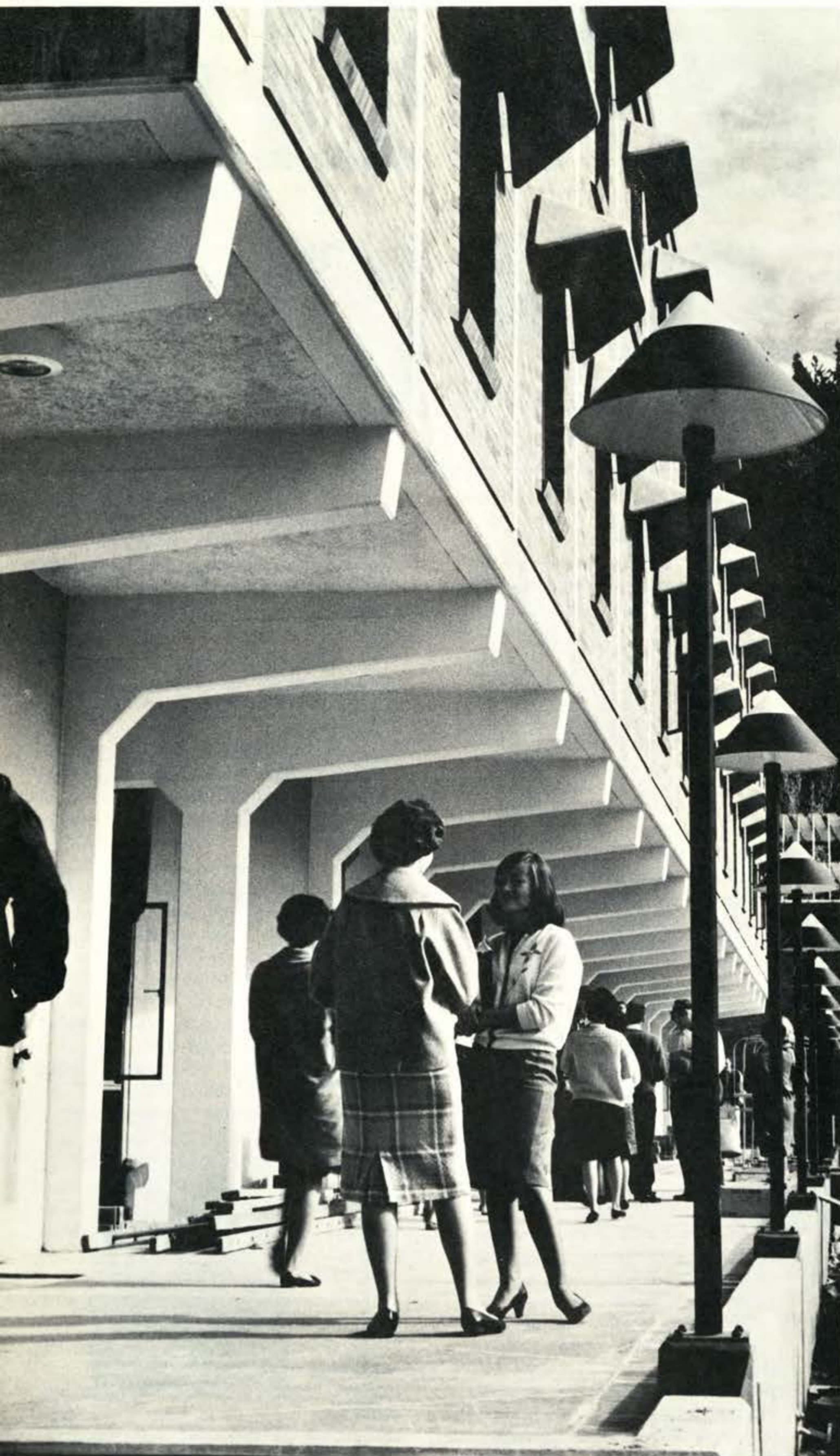
The striking design of architect Fred Bassetti is shown in this photo of the south side of the new $750,000 Humanities Building. All ten classrooms, located on the ground floor, have outside entrances. The 46 faculty offices, language laboratory, and seminar rooms are on the second floor.

"We are getting a lower percentage of students from Whatcom County each year and a higher percentage from King County," Goltz said. "This, along with increased enrollment and a move from off-campus housing easily filled the new 400 rooms." Regarding the latter, Goltz was referring primarily to students who left the Bellingham Doric Hotel where the