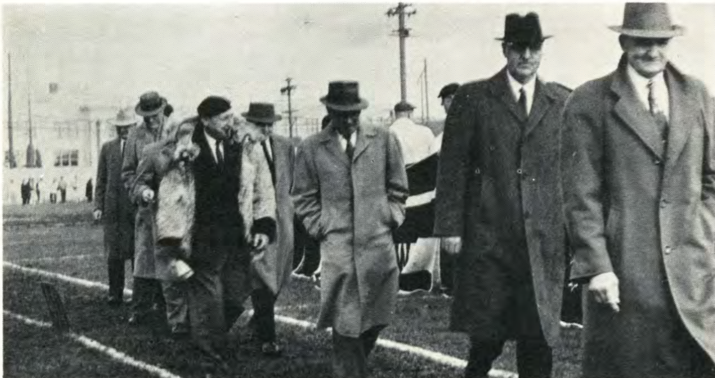
1921 Team Comes Home

A damp note was Western's 14-6 loss to the University of Puget Sound in the Homecoming game. But the 1921 team members could take some pride in the fact that they beat a UPS team in the Homecoming game 40 years ago.