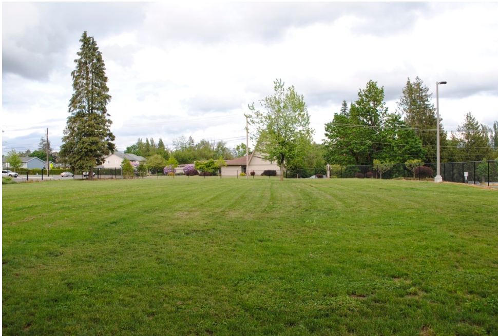
Figure 1: Picture of ECEAP play yard that lacks play structures due to licensing regulation

With regard to outdoor nature exploration, teachers voiced many challenges and barriers to routinely leading their children on outings outside of the play yard. See Table 3. The greatest reported obstacle was flight risk, or a fear of losing a child. When asked