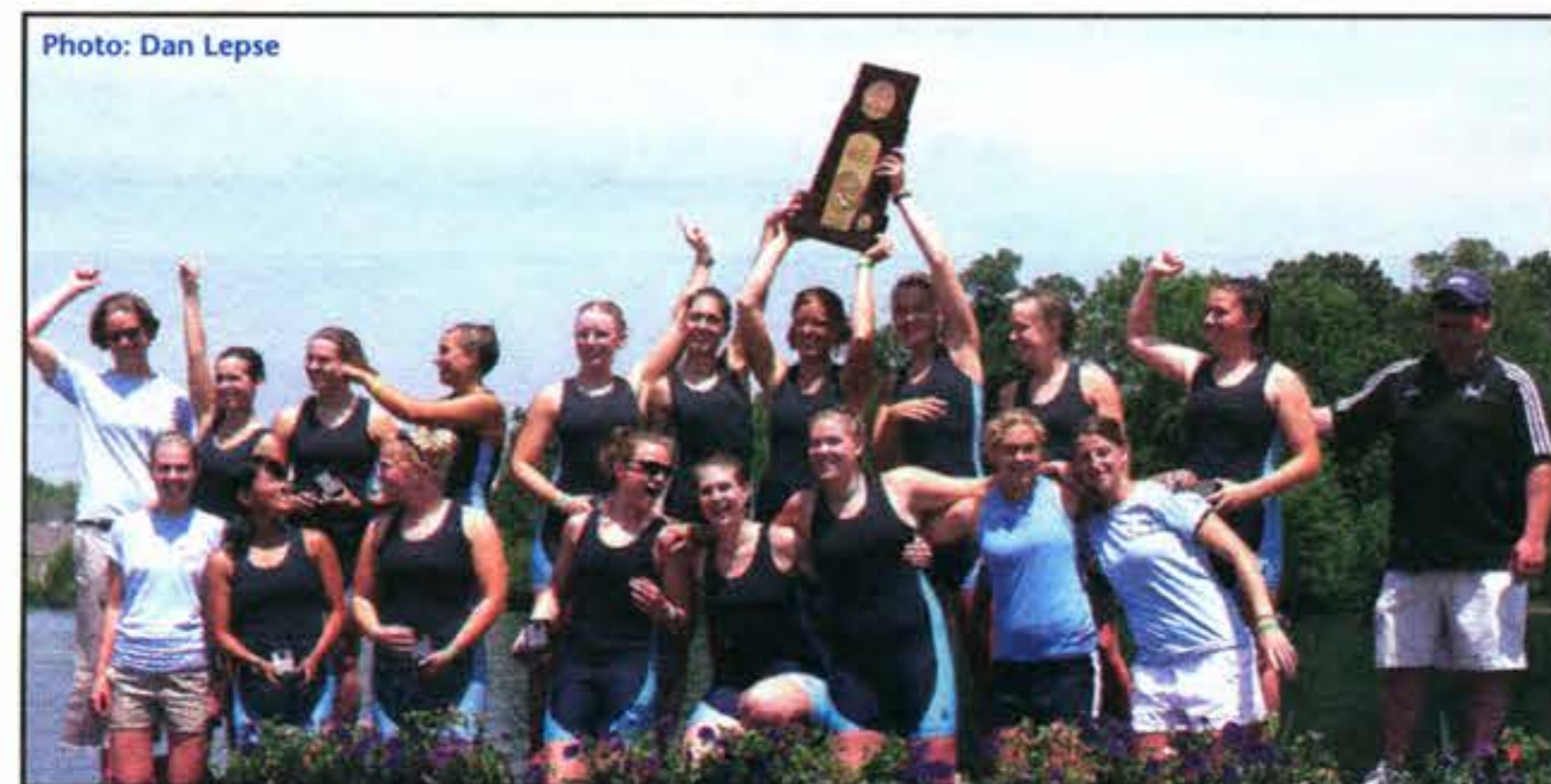
For the second year in a row, WWU took home the NCAA II Women's Rowing National Championship trophy, winning both the varsity four and varsity eight grand finals.