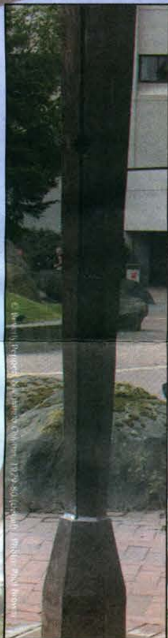
© Mark di Suvero, For Handel, 1975

Also named in the Public Art Review top 10 listing (spring/summer 2006) are the University of California, San Diego, Arizona State University, Texas Tech University, Pratt Institute in New York, Massachusetts Institute of Technology, University of South Florida, Wichita State University, University of Minnesota and Johnson County Community College in Kansas. Public Art Review is published by Forecast Public Artworks, a nonprofit organization, and is considered to be the leading magazine in its field.