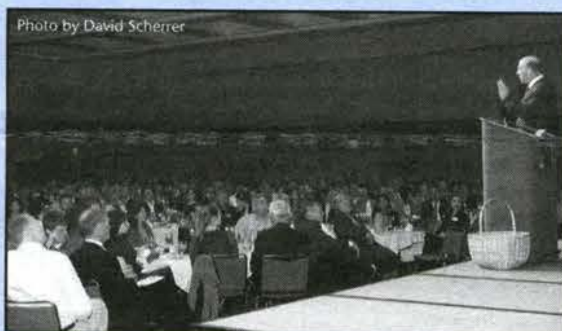
Steve Ballmer addressed a crowd of approximately 700 Western alumni and friends at the ninth annual Seattle Business Forum.

Alumni and friends donated over $100,000 for scholarships and University support at Western's ninth annual Seattle Business Forum, held April 18 at the Washington State Convention and Trade Center.