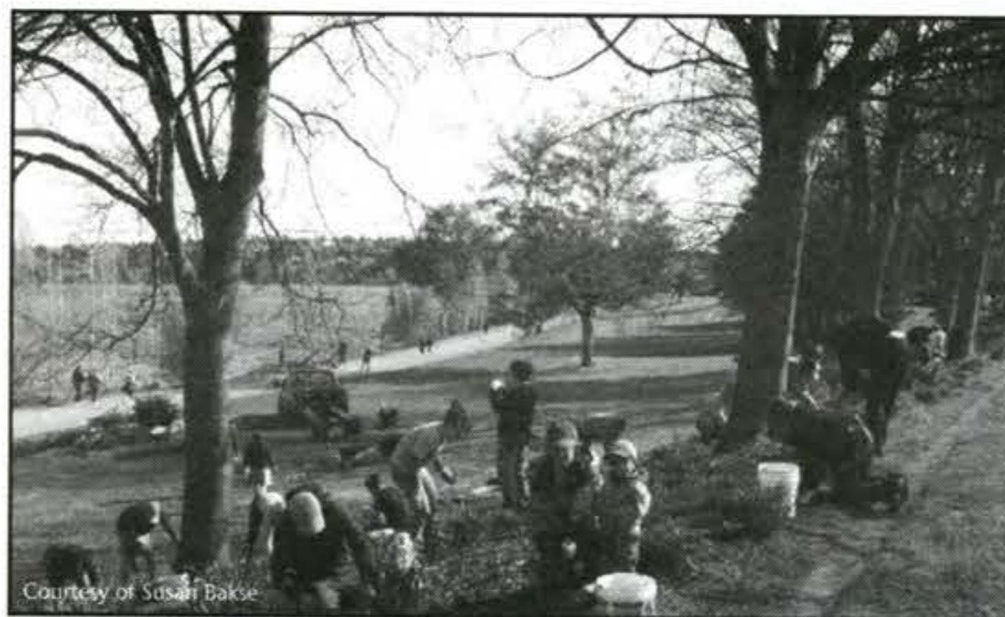
Alumni from the Seattle area recruited family and friends and cleaned up Green Lake Park on Volunteer Day, April 22. Over 240 WWU alumni in Washington state and California participated in Volunteer Day activities.