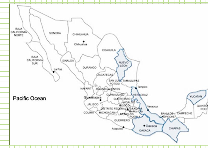
Figure 1 Epidemiological distribution of knowledge about herbal medicinal plants in Mexico highlighting that fieldwork to establish the use of medicinal plant species has been carried out only in Nuevo Leon, Veracruz, Oaxaca, Chiapas, and Yucatan states (Valdivia-Correa et al).

The Mexican health system underwent big changes starting in 2000. The goal of the changes was to expand access to care for the 52 million Mexican citizens previously without insurance. The way that Mexico decided to approach this goal was in increasing the scope of their social security program (Frenk). This has improved access to care and verification of the caregiver credentials, but the care is distributed unequally (Frenk, Flores-Hernández).