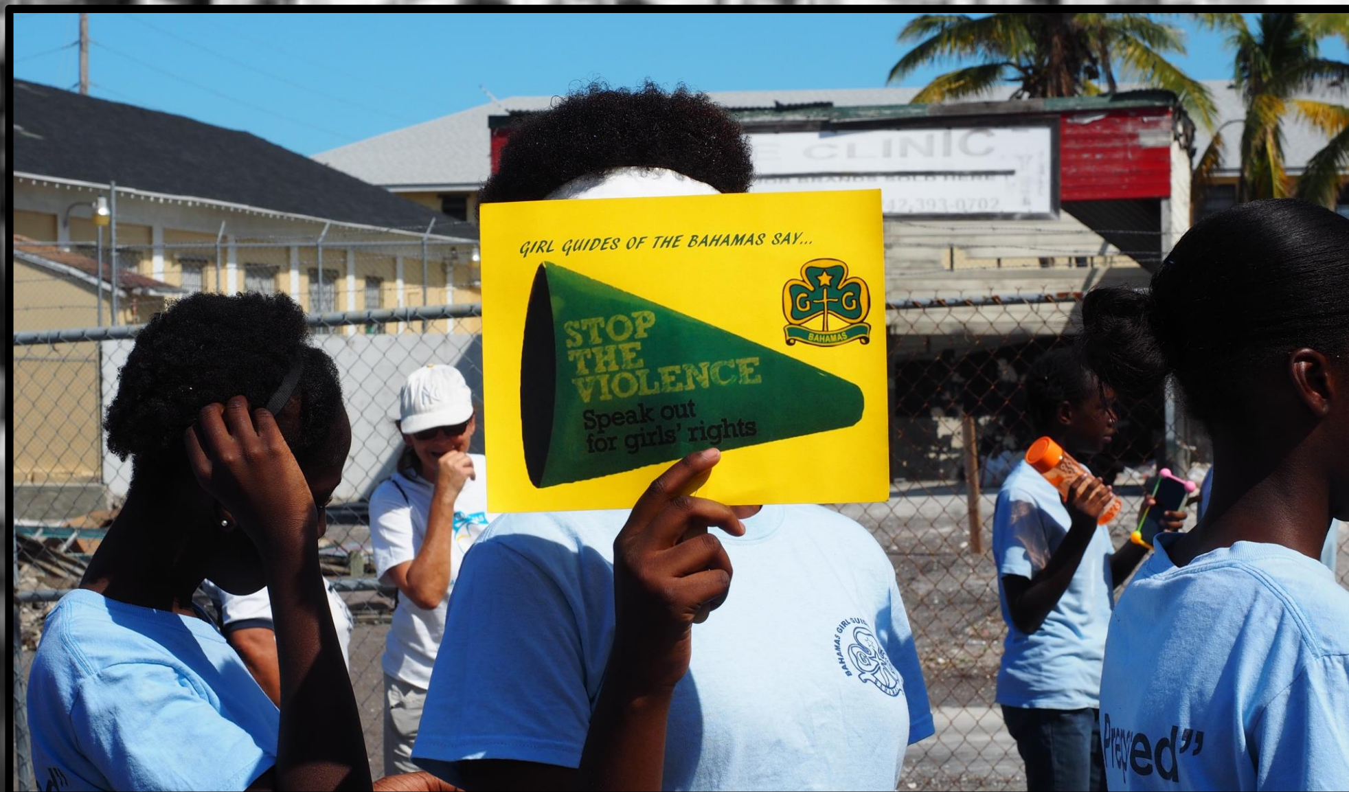
Wallace, A. (2017). Taste Of Life. Retrieved from http://shuganspic.com/tasteoflife/articles/life-in-leggings-bahamas.html