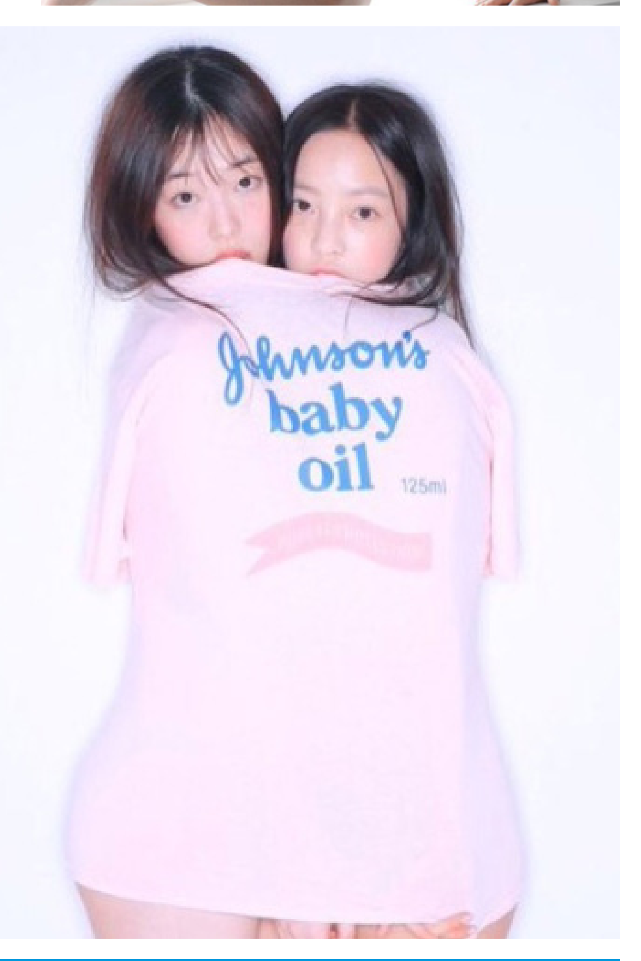
#일본여행 #오사카 #로타 #rotta #내가찍음 02/24 오후 01:32