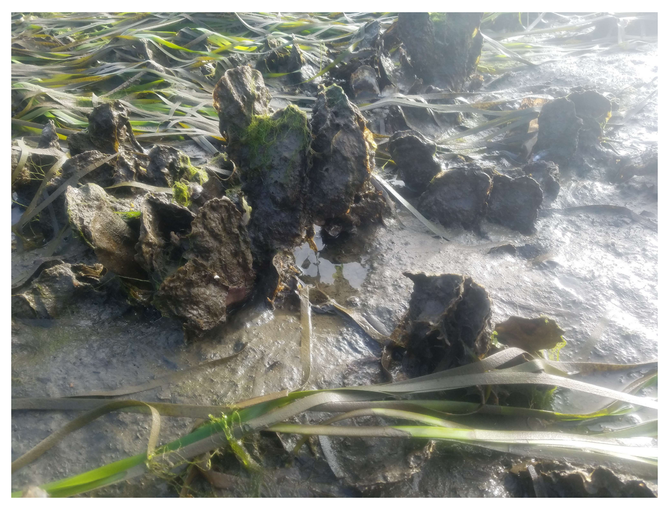
Photo I. Pacific oysters and eelgrass co-occur in the intertidal zone in Willapa Bay, WA, USA.