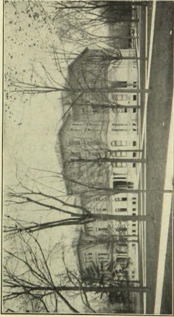
THE LAW BUILDING