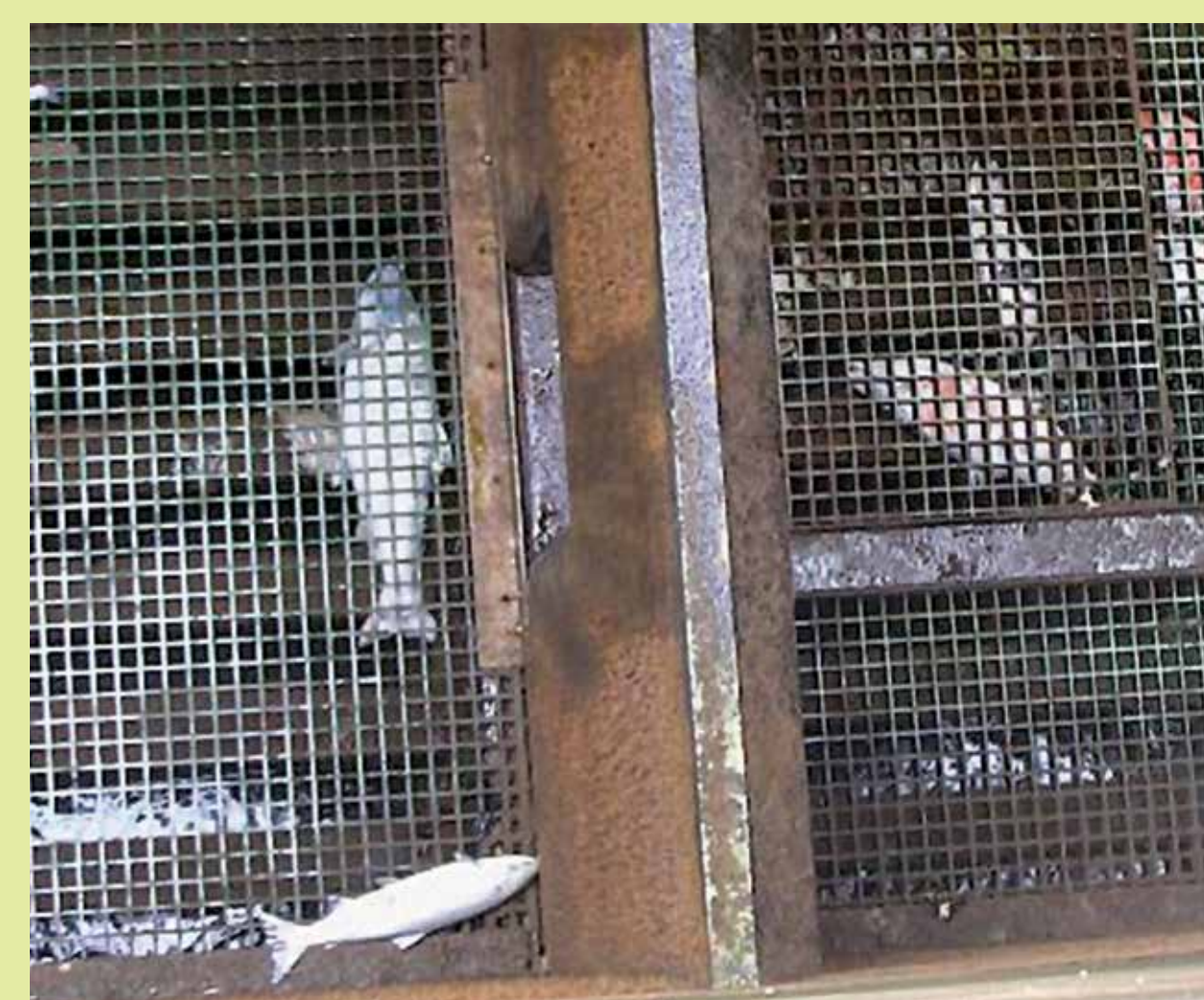
Dead salmon in the diffuser well of the fish ladder

The Locks also protect the lakes' water quality by preventing Puget Sound saltwater from mixing with their fresh water.