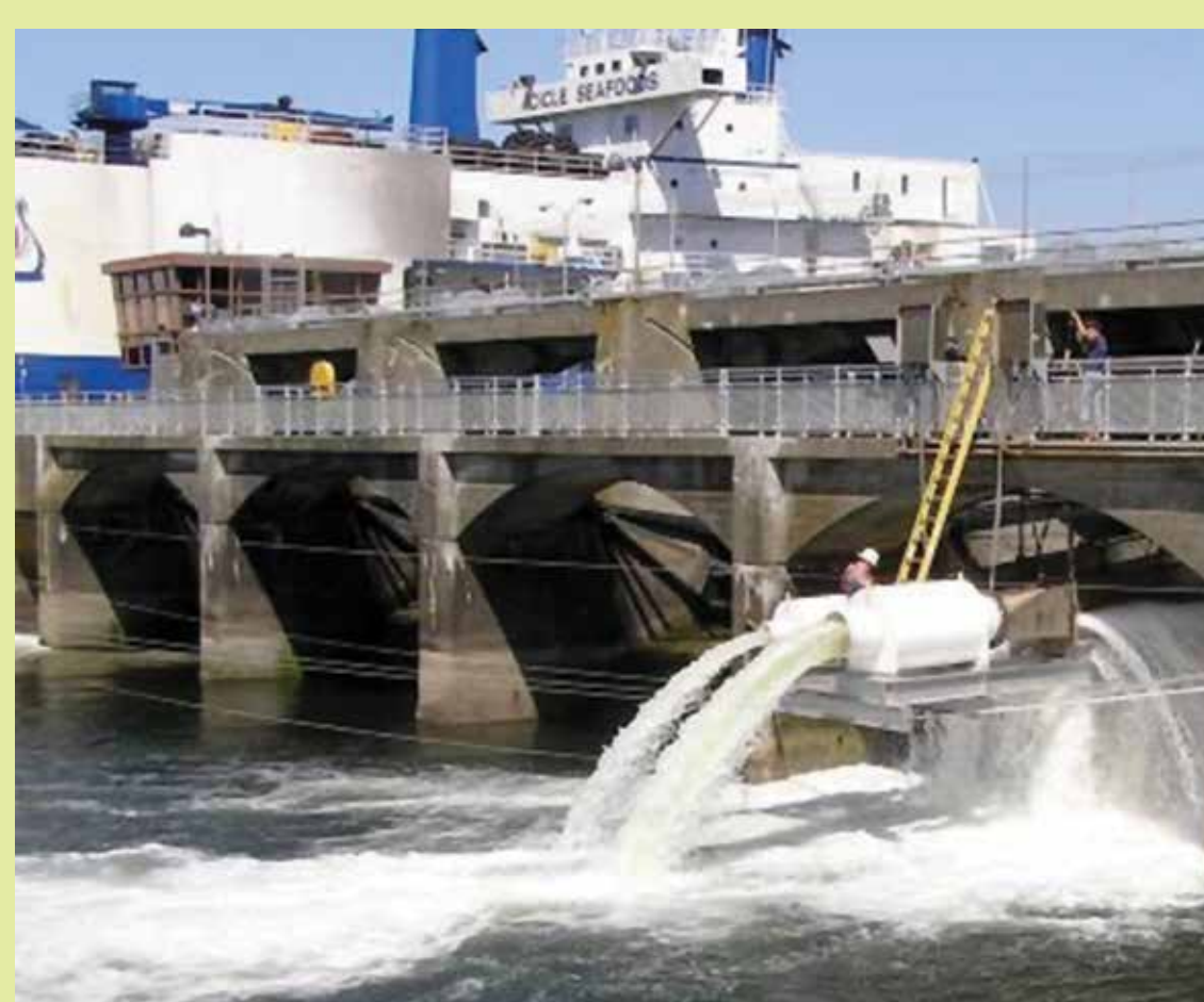
Smolt flume to get fish safely over the spillway