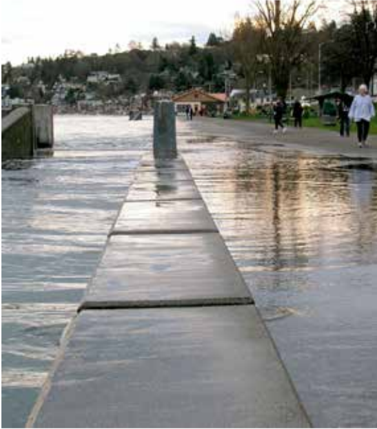
Sea Level Rise