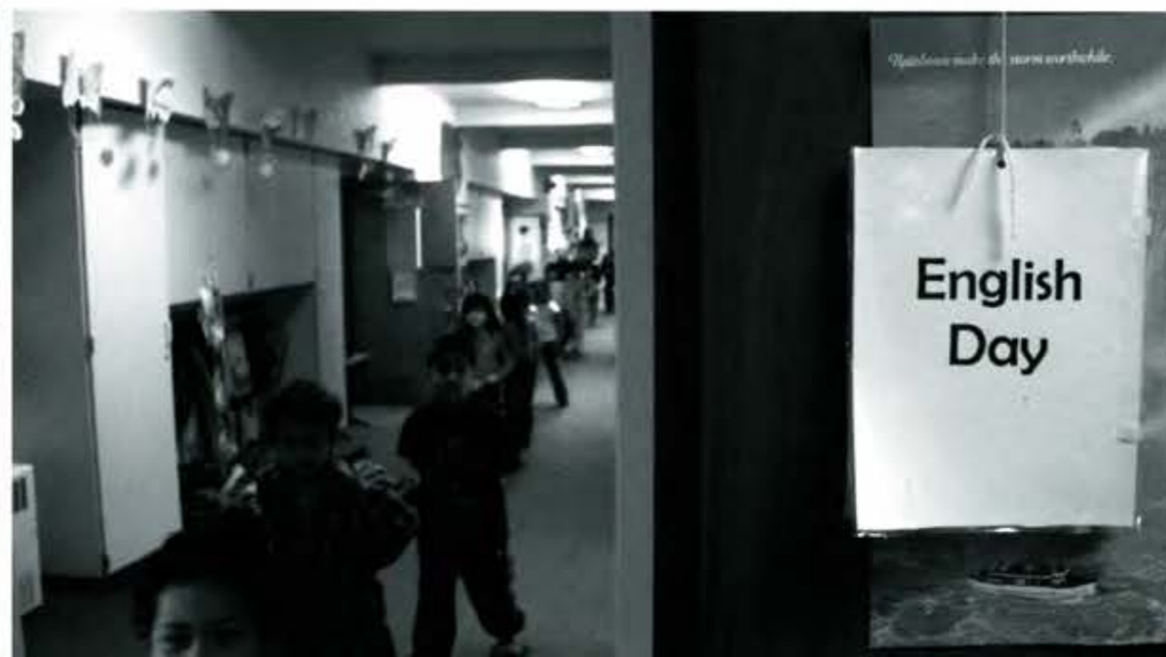
Below: As students file out of their classrooms, the sign on the wall is a reminder of which language to speak during lunch and recess.