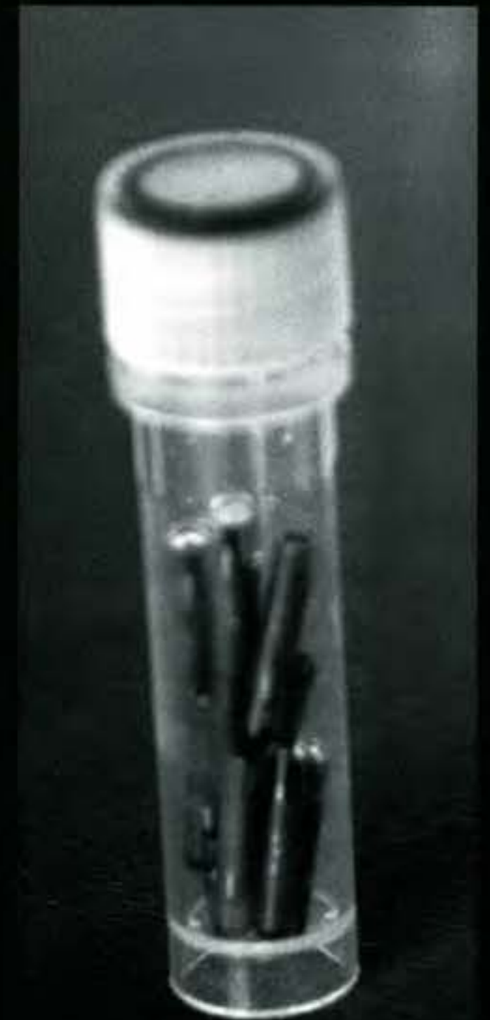
These quarter-inch chips can be implanted under the skin between the index finger and thumb.