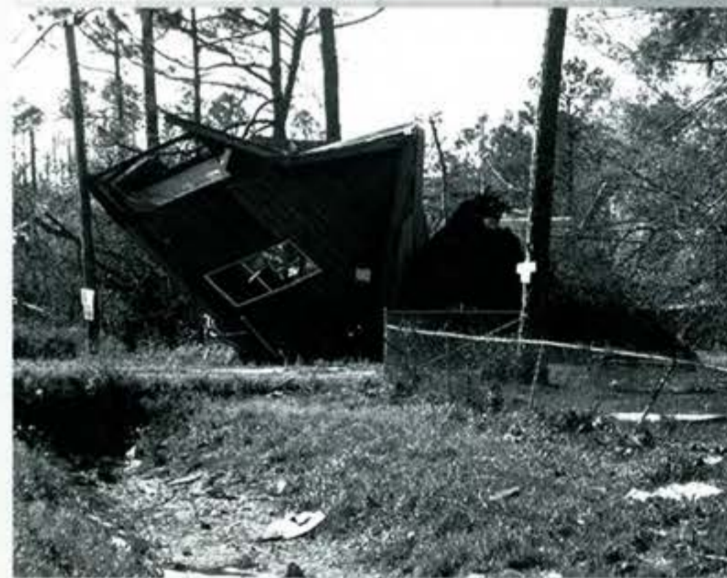
Right: A house remains intact after being blown off its foundation. It was found at the side of the freeway.