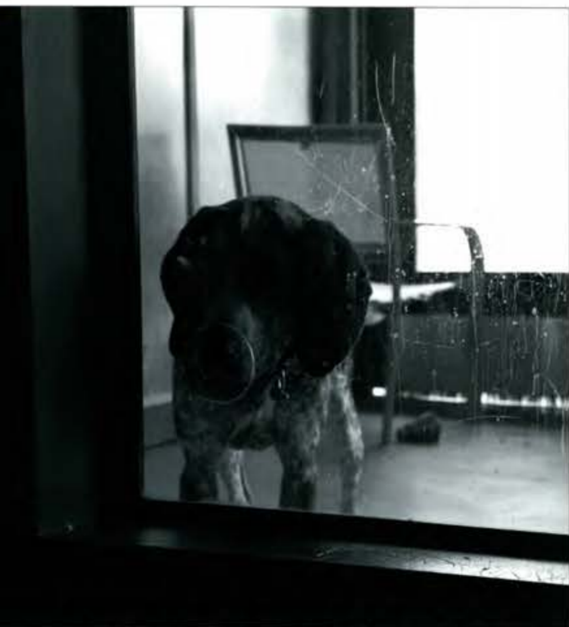
Yuna pokes her nose through a hole in the window of her suite at the N.O.A.H. Center as visitors pass by.

Outside the center, Yuna trots happily through the parking lot on her way to the trails, occasionally pulling on her black leash and sniffing something invisible to the human eye. And on this clear spring day, Yuna can rest easily. She has no time limit at the N.O.A.H. Center. She will either be given a carefully chosen home or remain at the center. There is no expiration date on her life. 🐾