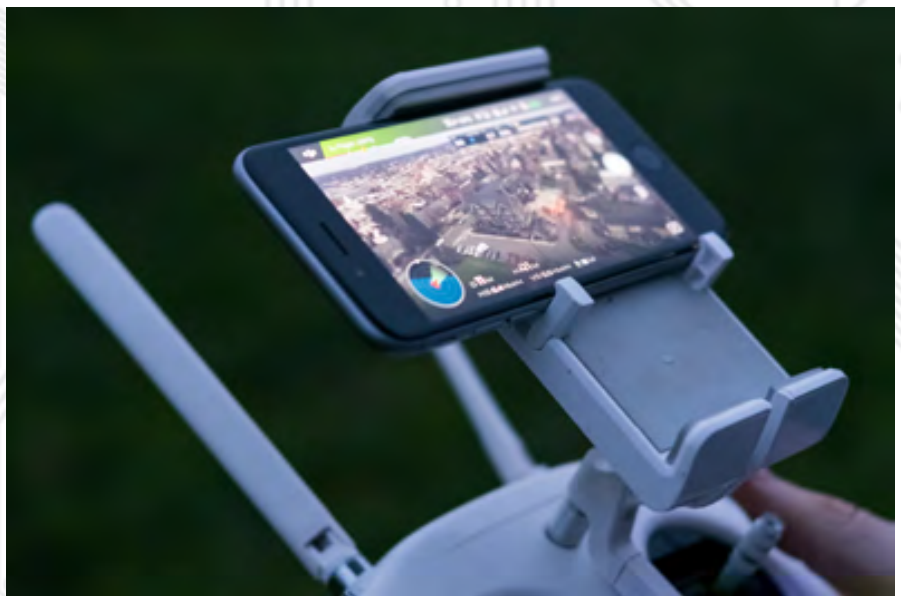
The DJI GO app shows the view of downtown Bellingham as seen from a drone 41 meters up.