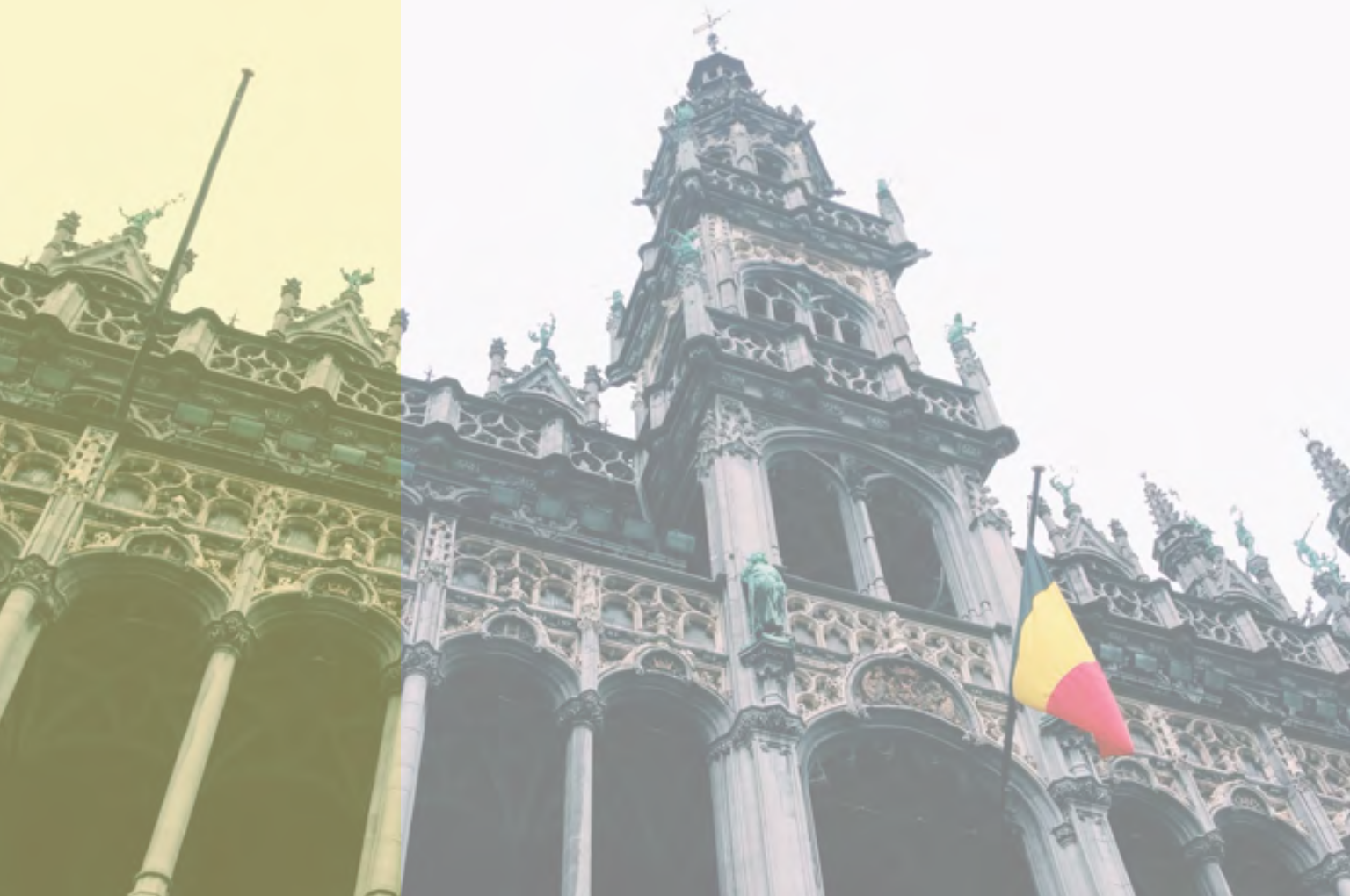
The Museum of the City of Brussels, or King's House. It stands in La Grand Place, a famous group of buildings in a plaza dating back to the 17th Century

Personal narrative written by Janae Easlon