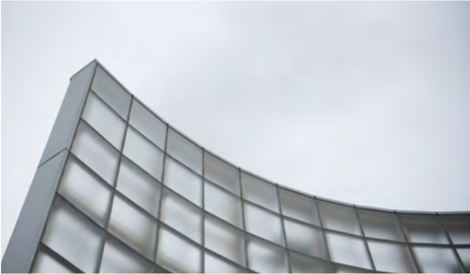
The Lightcatcher Museum, named for its uniquely designed translucent wall meets LEED Silver-Level specifications. The building is the first museum in Washington state to earn this qualification.