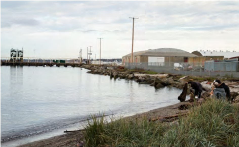
Glass Beach and the neighboring site of a former municipal landfill will undergo cleanup and renovation to create Cornwall Beach Park, which is projected to be Bellingham's largest waterfront park.