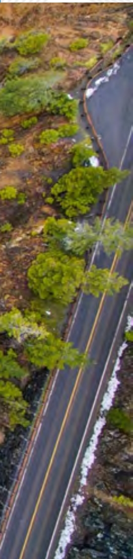
The Nooksack River flows next to Highway 542 in Washington state.