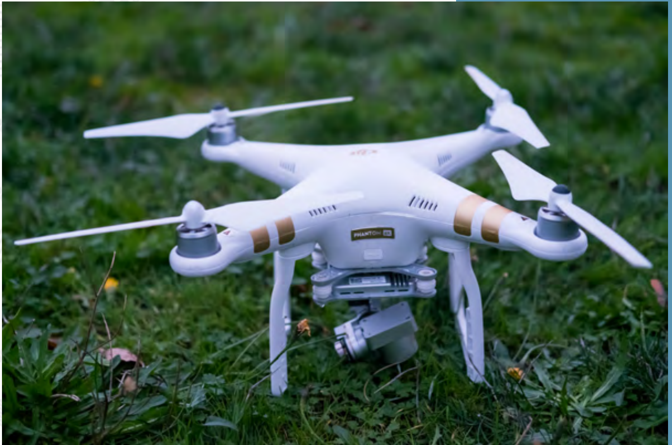
A DJI Phantom 3 4K drone sits in the grass waiting to be flown.

creator, known for his viral videos and his nontraditional storytelling. Neistat's more recent work heavily features video from different drones, such as the DJI Phantom series, GoPro and the recently released DJI Mavic.