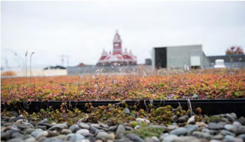
On the second floor of the museum, guests can venture outside to the living roof and take in the scenery of the elegant building, as well as gaze Old City Hall – a piece of the Whatcom Museum complex – across the way.