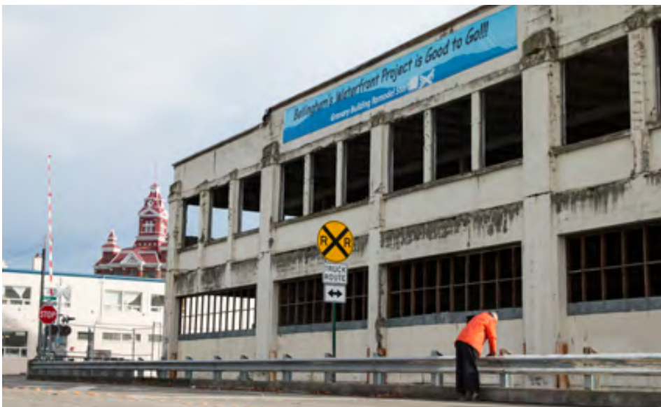
The Granary Building is the first waterfront building to undergo renovation and restoration to house restaurants, commercial and office space.