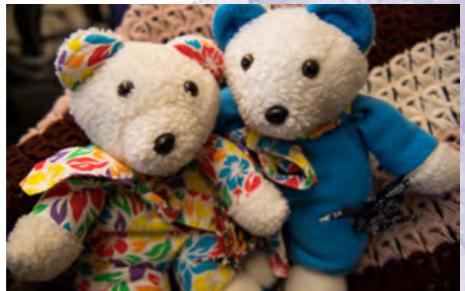
Whatcom Hospice holds memory teddy bear workshops a few times a year. These two bears serve as examples for the grieving when using meaningful fabric to craft their own bears.