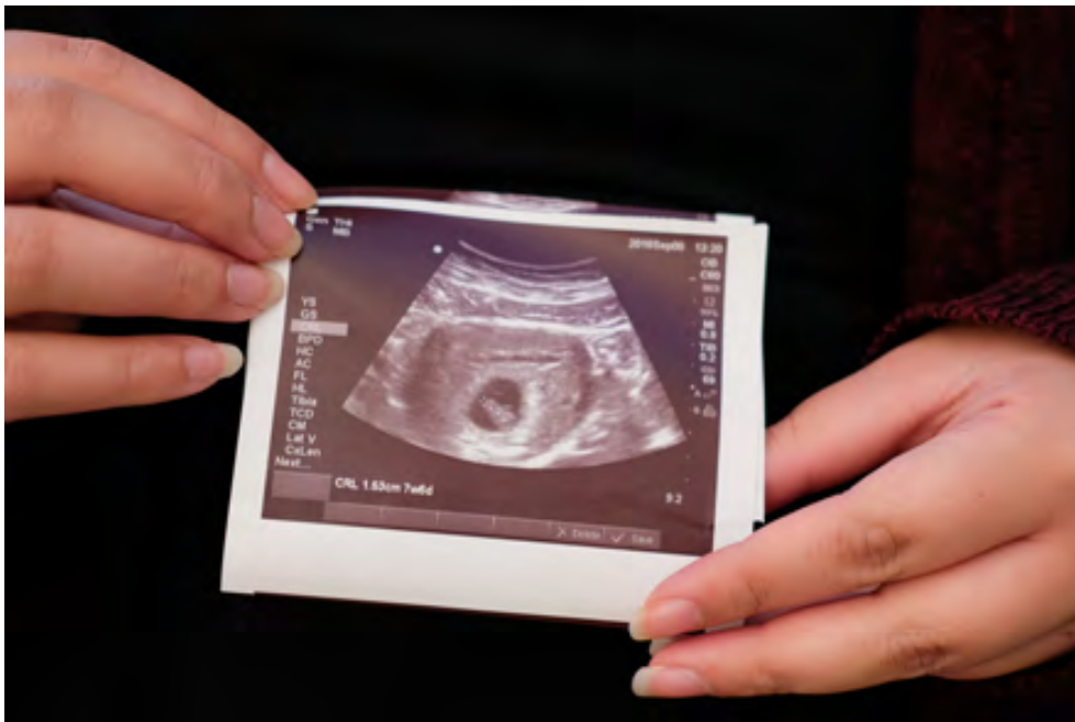
The ultrasound photo taken on the day of my abortion is the only physical thing I have left from my experience.