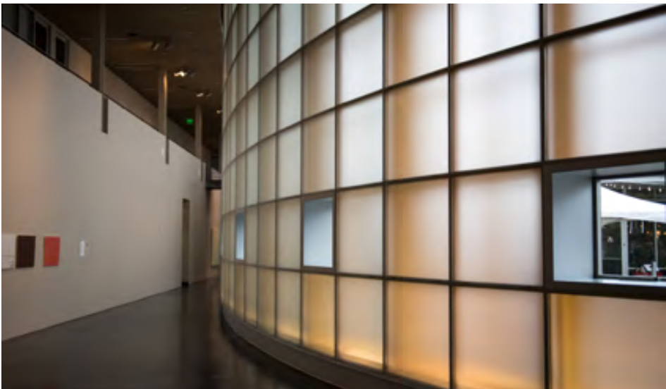
The Lightcatcher building of Whatcom Museum, located on Flora Street in downtown Bellingham, is masterfully designed to not only be environmentally friendly, but it is a simple yet elegant home for the art exhibits it houses.