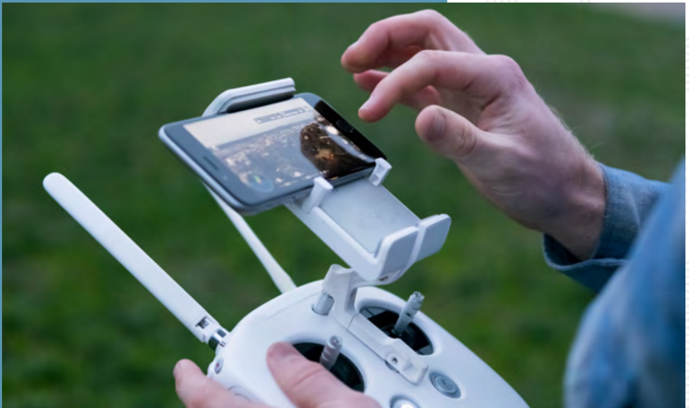
Klipsun photographer Kjell Redal shows how settings can be changed from a phone app.

Only a drone can see what’s around the corner. ■