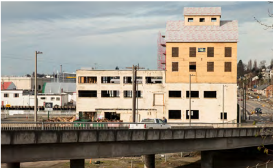
In the summer of 2016, construction began on the Granary Building as part of Bellingham's waterfront renovation project. Built in 1928, the Granary functioned as a cooperative market for farmers until it was purchased by Georgia-Pacific in 1970.