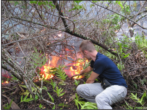
Figure 6. A modern example of a hominin lighting a stick by placing it on an active lava flow.

tial arguments about the role of tectonic landforms with the strongest elements of Wrangham's (2009) and Burton's (2009) pyrogenesis hypothesis. The result is my proposal here that, for millions of years, active lava flows in the African Rift provided consistent but isolated sources of fire, providing very specific adaptive pressures and opportunities to small isolated groups of hominins. This allowed these groups of early hominins to develop many of the adaptations mentioned above. Eventually, large brained, bipedal, cooked-food eating, tool using, Homo erectus emerged and mastered the quintessential human technology when they learned to make fire itself. This technology allowed them to move out into the rest of the world, taking a new kind of fire with them that would change the ecosystems everywhere they went.