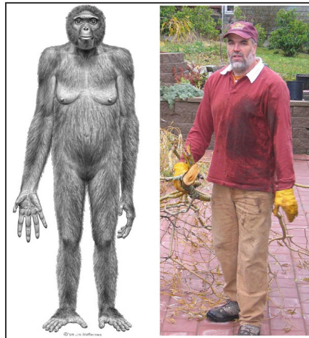
Figure 2. On the left is Matternes' interpretation of a 4.4 million year old female Ardipithecus adapted from Lovejoy et al. (2009). On the right the author demonstrates the utility of bipedalism and grasping hands for fuel gathering, as well as modern yard cleaning.

Bipedalism developed at least 4.4 million years ago in Ardipithecus ramidus , popularly known as Ardi, and perhaps millions of years earlier than that (White et al. 2009). Perhaps this new form of locomotion freed up powerful arms and restructured hands for fuel gathering. Bringing dry wood and food to an existing fire would be a powerful new ability for a hominin living with fire. Looking at J.H. Matternes' artistic rendering of Ardi, (Figure 2), it is easy to imagine her being particularly helpful in both climbing into trees and moving dead branches to an already burning fire.