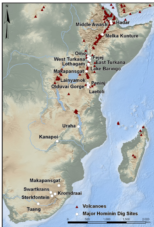
Figure 4. Strong geographic evidence that hominin evolution is somehow related to tectonic activities and volcanism. (adapted from King and Bailey [2006]). (Cartography by Allyson Hayes and Alyssa Weatherford.)

As a geographer, I am predisposed to the spatial persuasiveness of King and Bailey's (2006) paper. They argue that there must be something about the tectonics of the African Rift that drove hominin evolution. However, I propose that we combine their very strong spa-