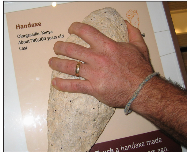
Figure 3. The author's rather large hand illustrates the size of a replica of an Acheulean hand axe found in the Smithsonian Institute. This large axe seems inconvenient for meat cutting but quite practical for fuel cutting.

Hair does not fossilize well, so we are unsure just when hominins may have become hairless. However, hairlessness was proposed as an adaptation to fire as early as 1978 by Claire Russell (1978). Researchers have estimated when hairlessness might have first occurred in our lineage using the DNA associated with skin color to argue that hairlessness arose