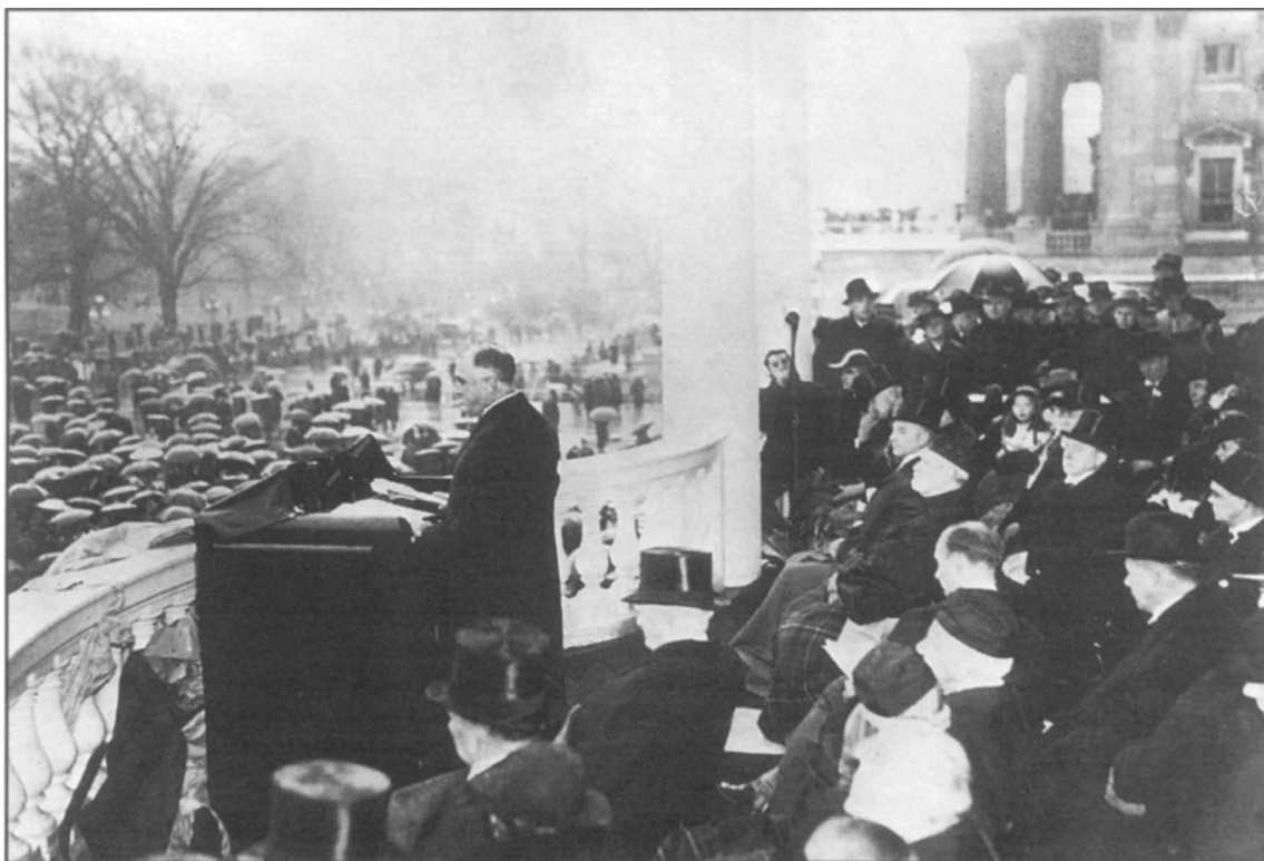
Charles Evans Hughes swore in Franklin D. Roosevelt when the President (addressing the public) took the oath of office for the second time on January 20, 1937. As the skullcapped Chief Justice (seated at center) reached the promise to defend the Constitution, he “spoke slowly and with special emphasis,” and the President responded in kind.