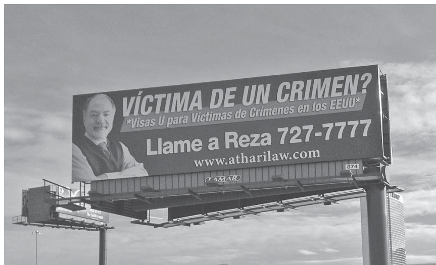
FIGURE 1: ATTORNEY BILLBOARD IN LAS VEGAS, NV, IN 2014, ADVERTISING “U VISAS FOR VICTIMS OF CRIME IN THE USA.”