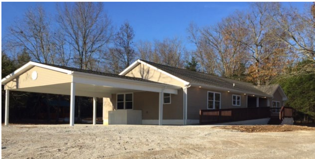
Figure 4: WeCare Clinic – Medical Care for Special Needs

educational programs and resources to assist these lay midwives in recognizing signs and symptoms of genetic disorders at birth thus enabling them to make quick referrals is warranted.