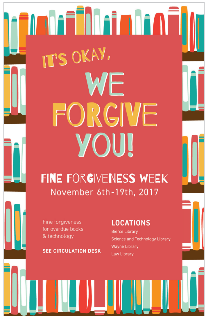
Poster for Library Amnesty Event.

Bierce Library and the Science and Technology Library hosted the second annual fine amnesty event in the Fall to welcome patrons and materials back to the library. Almost $8000 in fines were cleared, 76 library blocks cleared and 14 PeopleSoft holds cleared allowing more students the opportunity to enroll in classes and complete their degree.