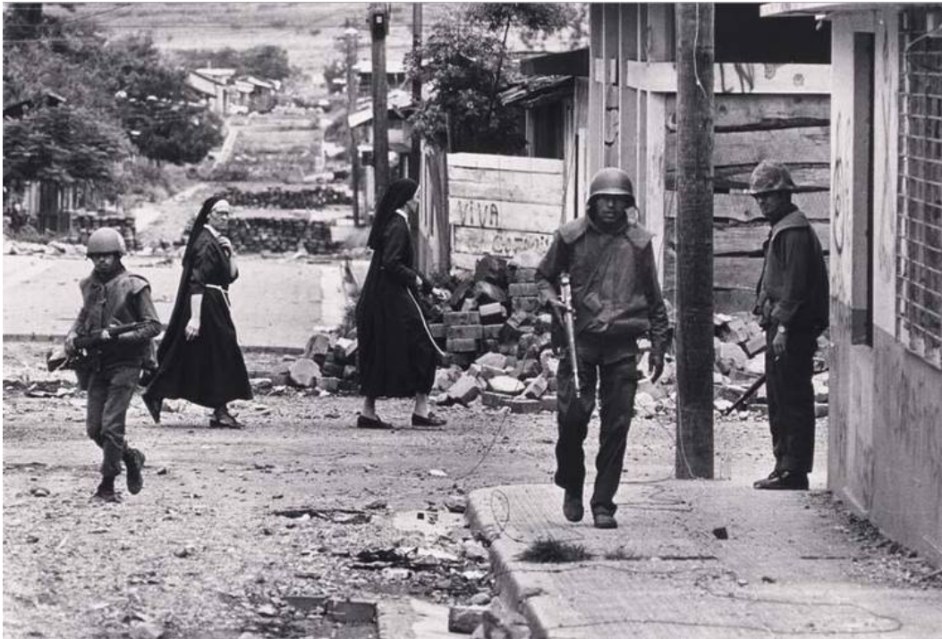
Nicaragua, 1979 by Koen Wessing.

The Koen Wessing photograph, Nicaragua, 1979 , depicts the ironies and tragedy of war in a subtle yet striking manner.