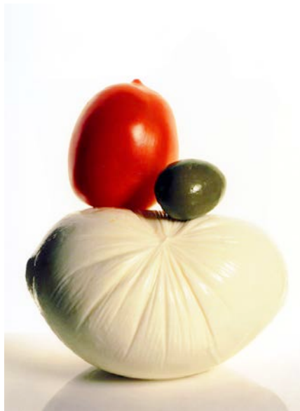
Italian Still Life (B) . (1981) Irving Penn.

How can we make image documents more accessible for the individual who is blind or visually impaired? One approach is to translate the document into a different format or medium so that the user can employ an alternative sensory modality. We can call this conversion process a transmedial translation, or a transmediation . The term is not used in the sense of creating a multitude of stories around one story in many different media, as has been described in literacy literature (Scolari, 2009). It is, however, tangentially related in that a document in one medium is presented in another medium. The biggest difference between these two processes is the desire in this situation to adhere as closely as possible to the original document rather than to create or expand upon narrative arcs. Perhaps the term intermediation would be more apt as it denotes a journey across from one state to another. The intermediary stands between these two states. This term is also problematic, as it is commonly used to refer to the resolution of legal disputes via a neutral third party. For now let us call it transmediation and explore the concept without too much rumination over the label.