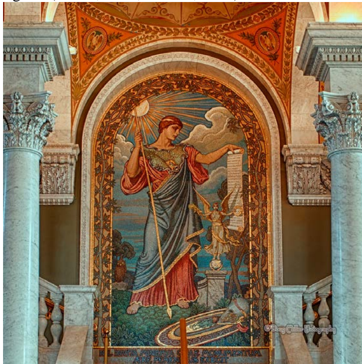
(Vedder, 1896; Miller, 2013)

We can see examples of other challenges to representation when we view the mosaic Minerva of Peace on the wall of the Thomas Jefferson building of the Library of Congress (Miller, 2013; Vedder, 1896).