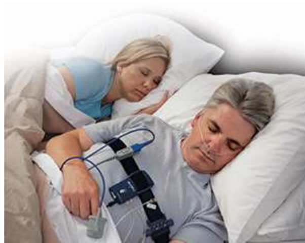
Figure 3: Example of what a Home Sleep Test (HST) would look like

After the diagnosis is done by sleep specialist, and there is any sign of a severe abnormality, the patient is then required to do the sleep test again, but this time with a CPAP (Continuous Positive Airway Pressure) device, which is used to treat sleep apnea. The results are then analyzed and interpreted again to confirm the diagnosis, as stated by Alaska Sleep Clinic. According to VeryWell, the price of a sleep study itself ranges from $1,000 to $10,000, for example, a sleep study at Stanford University costs $8500. This is all dependent on the situation, location, and facility. Insurers usually cover most of the costs depending on one's coverage. On the other hand, according to the ASA, in-home testing usually costs between $150 to $500 covered fully by most insurers. If one has insurance, the reimbursement code for this test is ICD-10 with CPT Codes varying with the situation and age and listed below according to the American Academy for Sleep Medicine (AASM). CPT Codes for a normal polysomnography are many more than the ones for a at home sleep test which may imply the at home sleep test is not sufficient to accurately identify sleeping disorders. The list of codes used for both in home and normal sleep tests are listed below.