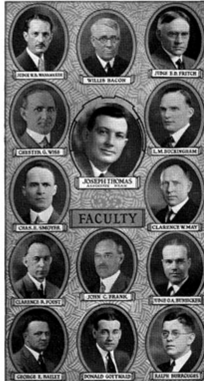
Akron Law School Faculty 1931-36

The Law School was formally incorporated in 1931. 153 In 1933,