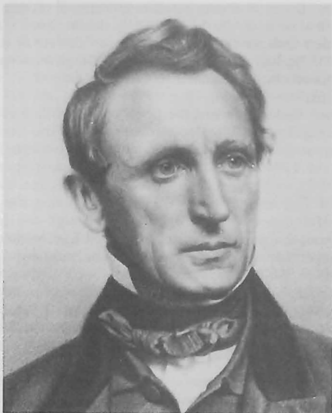
John A. Bingham

Bingham thought had been elected by fraud constituted a gross abuse and betrayal of power. Consequently, Bingham concluded, Buchanan was "wholly unfit" to have additional responsibilities placed in his care. Bingham thought it more appropriate to "prefer articles of impeachment against the President of the United States for high crimes and misdemeanors" than to place additional troops under his command. 50