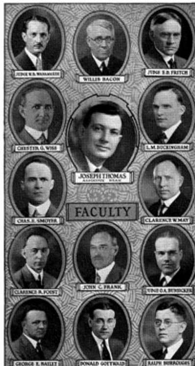
Akron Law School Faculty 1931-36

The Law School was formally incorporated in 1931. 153 In 1933,