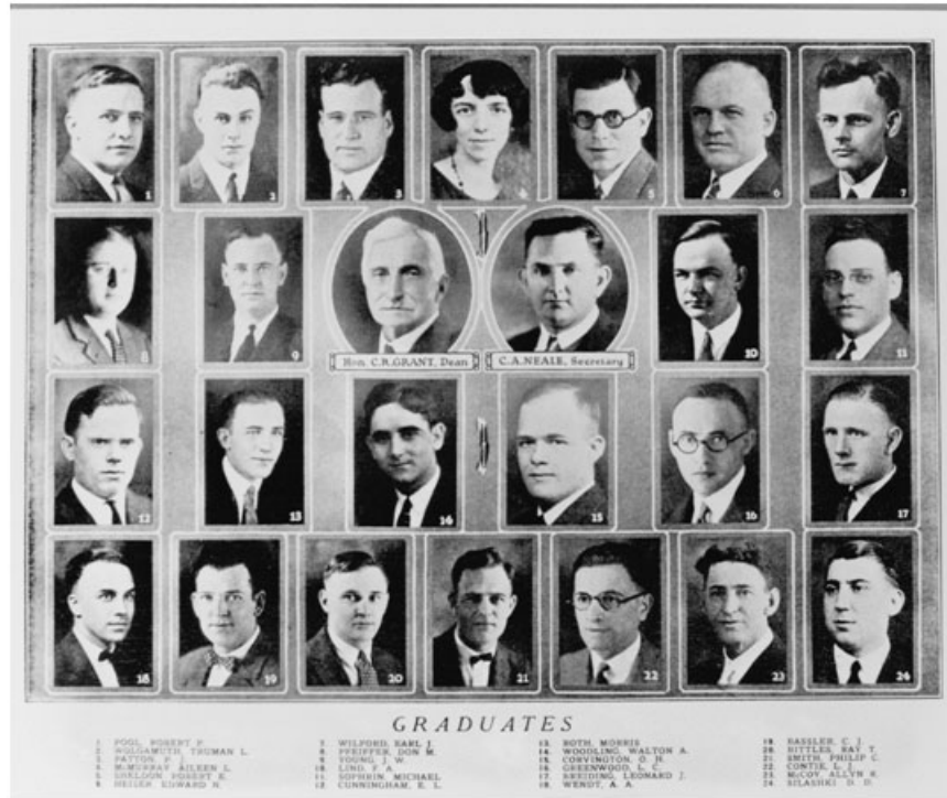
The Graduating Class of 1925

Of the thirty students who started in September of 1921, twenty-six were in the first class which graduated in 1925.