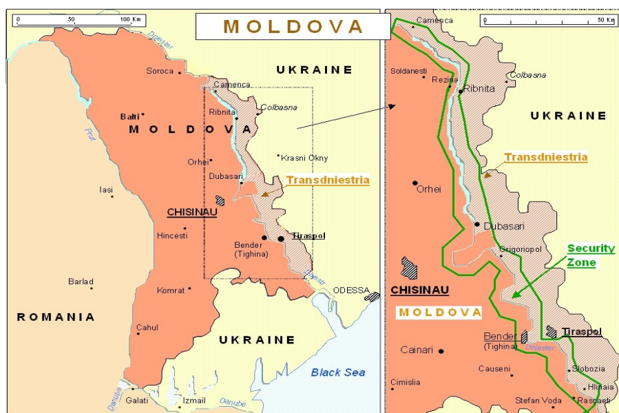
MAP H: THE SEPARATE REGION OF TRANSDNIESTRIA WITHIN MOLDOVA (1991-PRESENT)

Transdnistrians emphasize pre-Soviet history as justification for their separation from Moldova. 77 In addition to this, both banks adopt different views on the origins of the tensions between them that began in the 1980s, revealing the multiplicity of factors that have contributed to the creation of the de facto separate statehood of Transdnistria from Moldova today ( see Map H below ).