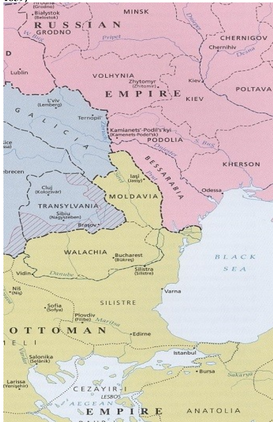
MAP C: BESSARABIA AS PART OF THE RUSSIAN EMPIRE (1812-1918), AND THE ROMANIAN PRINCIPALITIES OF THE OTTOMAN EMPIRE (1856-1859)

Source: Historical Atlas of Central Europe, 2002.