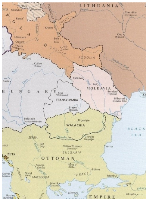
MAP A: THE PRINCIPALITY OF MOLDOVA (MOLDAVIA) UNDER STEFAN THE GREAT IN 1460