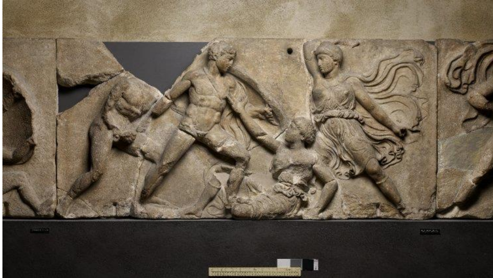
Figure 1. British Museum number 1815,1020.21

The artists responsible for these images may have lent their own opinions to the stories they were re-telling. Let us consider Iktinos, the supposed architect of the Temple at Bassai. 15 He was the most highly regarded architect in all of Athens having just completed the Parthenon a short time before construction started on the Temple of Apollo on Mount Kotilion in Bassai. Assuming that at least some of the trades people working on the Temple would have also been from Athens, there would have been quite a presence of Athenian culture in the impoverished and remote area of Arkadia, known for its contributions of men to fight in Greek battles. Exekias, the amphora artist, also hailed from Athens, but at a time when Athenian rule held an umbrella for democracy and expansion, his pottery eventually made it all the way to Italy. 16 The influence of Athens seemed borderless, but plenty of foreigners, and even some fellow Greeks, wished to stamp out its wide spread impact.