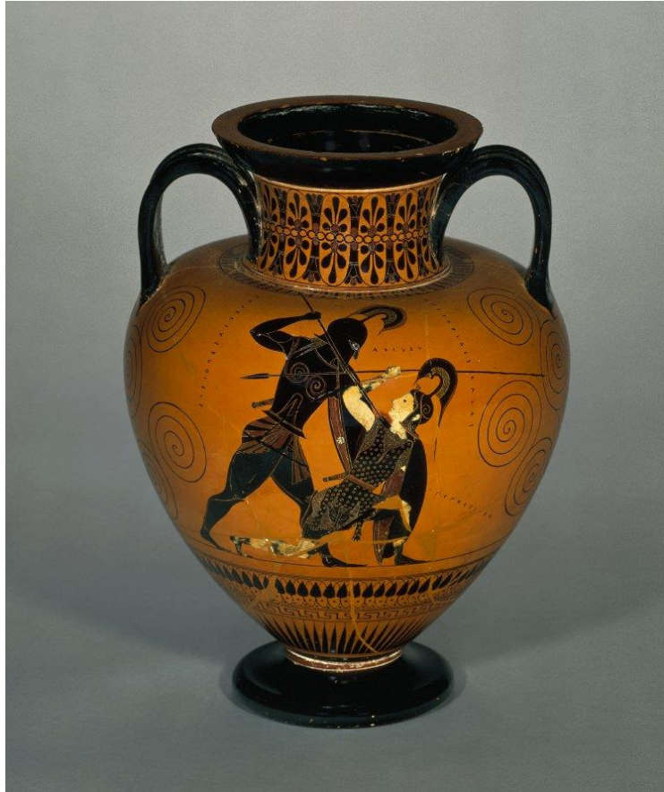
Figure 2. British Museum number 1836,0224.127

We may never know what qualities the Amazons possessed that truly drove the Greeks to keep constant reminders of them. Was it the idea that women could be skilled fighters with little to no need for male participation in their society? Did the notion of foreign invasion and the loss of lives become daily observation so as to keep the people of Greece on the defense? This vase painting would have invoked recognition of the heavily armed foreigners that encircled Greece like sharks ready to rip off chunks from the empire. Evenly matched battles would have sometimes lasted for years, as with the case of the Trojan War, until a victor could whittle down his opponent and stake claim to greatness. By the time of construction of the temple at Bassai we see these illustrations of struggle manipulated into the blatant Greek sided domination of all that stand in the way of Greece in many public art displays leading us to have little choice but to assume that this display evoked self-elevation among Greece's military and civilians. It is with this scheme in mind that Greek sculptors may have set out to rid the empire of the memory of damage done by the Amazons to Greek troops by portraying them as inferior to the feared warriors they were depicted as in legends.