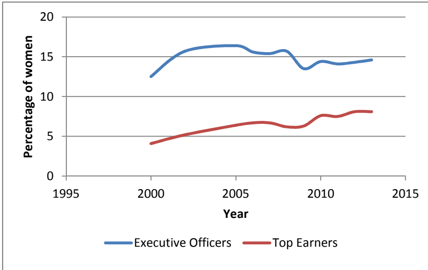
Exhibit II.1 Women among the Rank of Executive Officers and Top Earners in Fortune 500