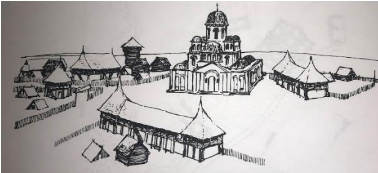
Fig. 1 A suggested reconstruction of the center of Kiev in the late tenth century after the completion of the Tithes Church. 64

Most of the buildings in Kiev were constructed of wooden planks and straw until the middle of the tenth century, when stone architecture first appeared in Kiev. 62 Archaeologists uncovered fragments of two of the earliest stone buildings inside of rampart and moat. Since only fragments of the building were recovered reconstruction is not feasible. However, the building was constructed of materials transported a considerable distance, including granite, sandstone, marble, and rosy slate. They also found, fragments of brick, polychrome tiles, and evidence of frescos and mosaics on the walls. 63